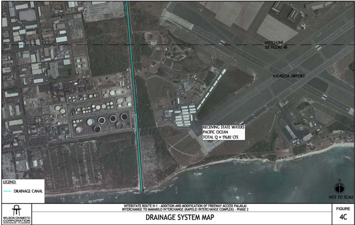
Map 2 –Outfall Map