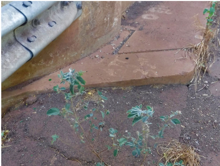
PHOTO 8 3-1/2" VERTICAL DIFFERENTIAL AT WEST APPROACH TO UPSTREAM SIDEWALK