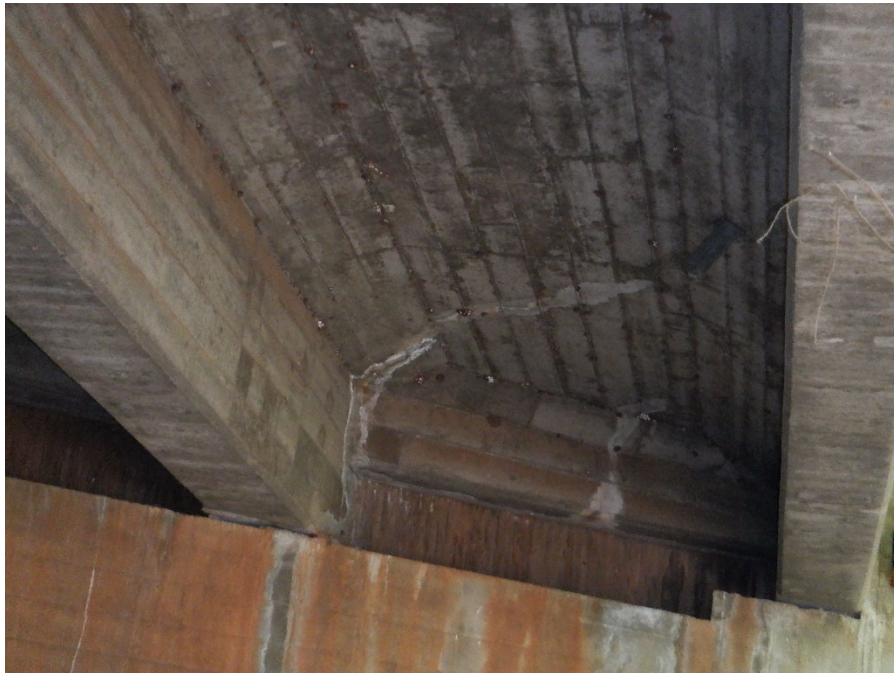
PHOTO 20 MODERATE WIDTH DIAGONAL CRACK WITH EFFLORESCENCE (8SF 1120 CS2) ON TOP FLANGE SOFFIT BETWEEN GIRDERS G3 AND G4 NEAR ABUTMENT 1