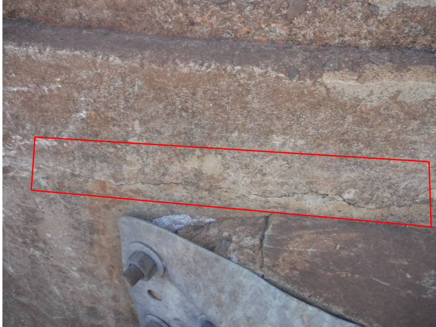
PHOTO 13 2 FT LONG HORIZONTAL CRACK AND DELAMINATION (2FT 1080 CS2) ON INTERIOR FACE OF UPSTREAM EAST END POST