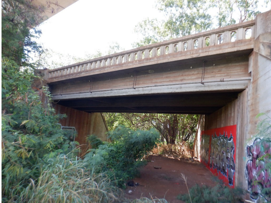
PHOTO 3 UPSTREAM ELEVATION