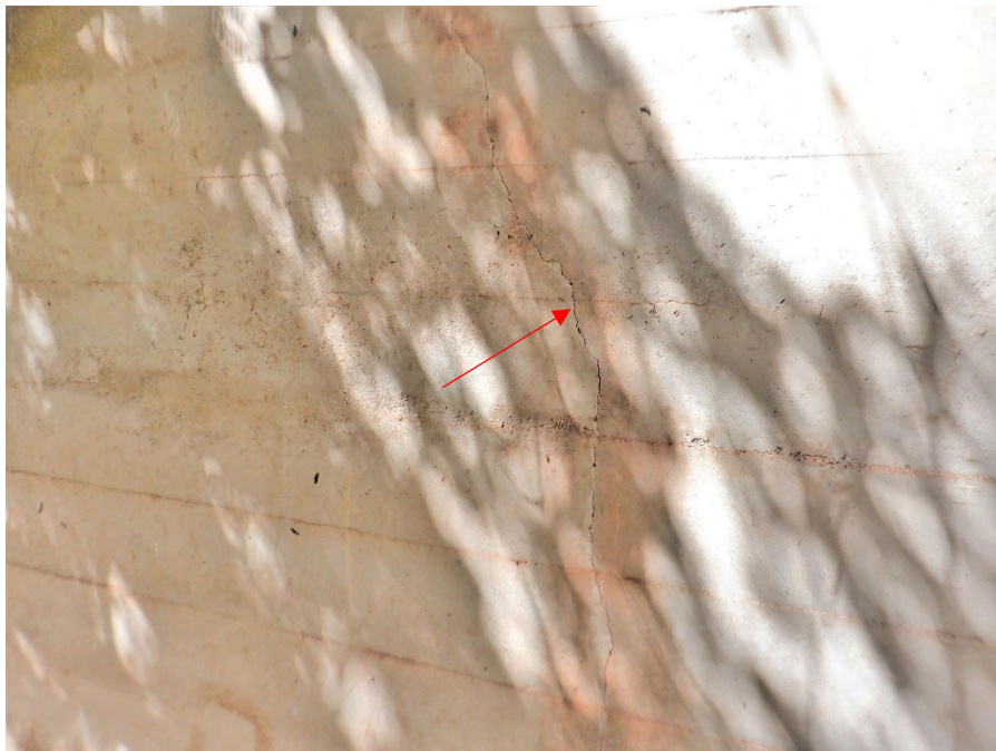
PHOTO 28 WIDE VERTICAL CRACK (1FT 1130 CS3) ON DOWNSTREAM WEST WINGWALL