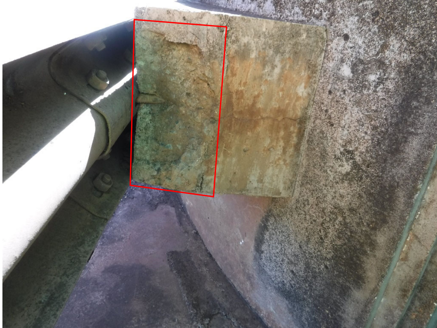
PHOTO 17 1'X6" SPALL WITH EXPOSED ANCHOR BOLT ON CONCRETE SPACER BLOCK AT DOWNSTREAM WEST END POST