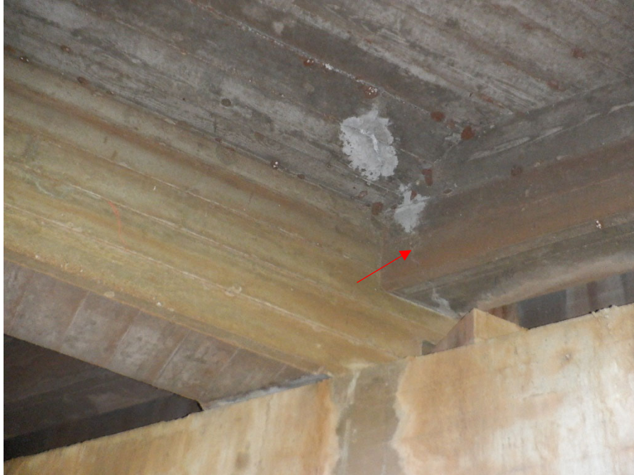
PHOTO 19 MODERATE WIDTH CRACK WITH EFFLORESCENCE (2SF 1120 CS2) ON TOP FLANGE SOFFIT AND DIAPHRAGM AT ABUTMENT 2 NEAR GIRDER G2