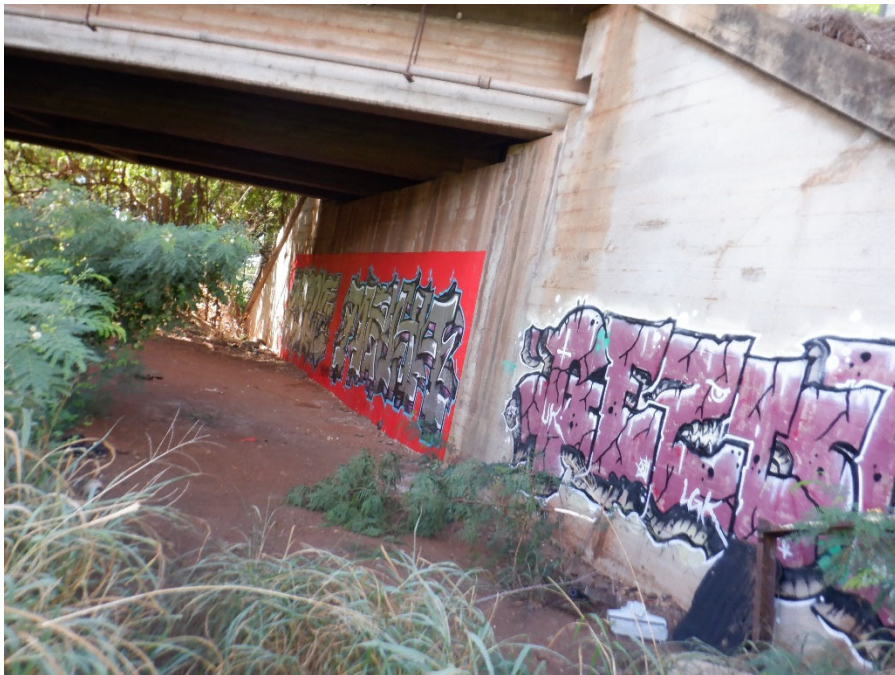
PHOTO 26 ABUTMENT 2