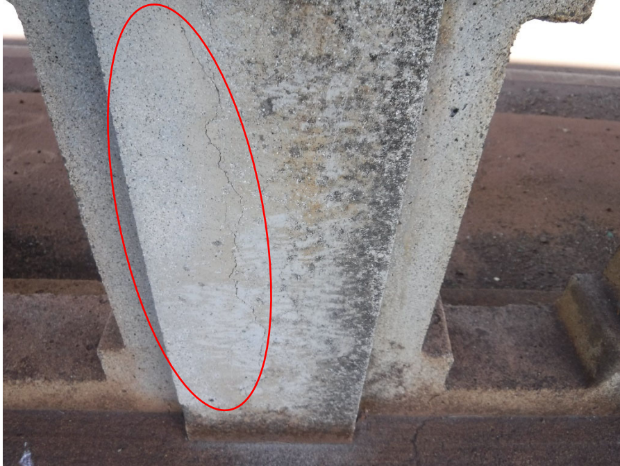
PHOTO 11 TYPICAL DELAMINATION (1080 CS2) ON EXTERIOR FACE OF UPSTREAM RAILING PICKET