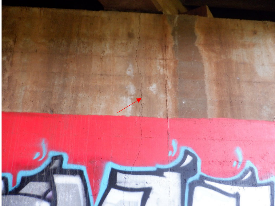
PHOTO 27 WIDE VERTICAL CRACK (1FT 1130 CS3) ON ABUTMENT 2 BELOW GIRDER G2