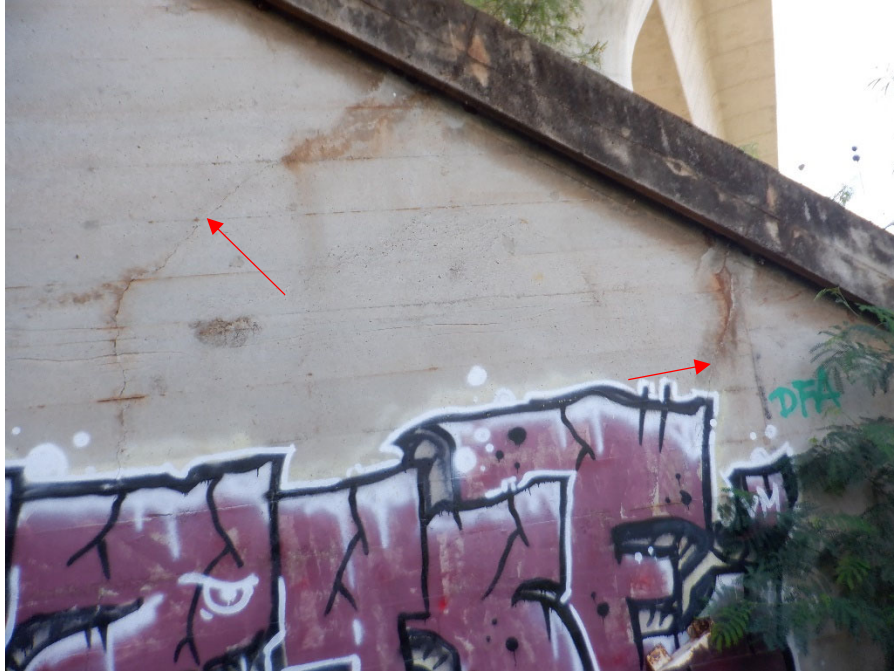
PHOTO 29 TYPICAL MODERATE WIDTH CRACKS (1130 CS2) ON BOTH ABUTMENTS AND ALL WINGWALLS