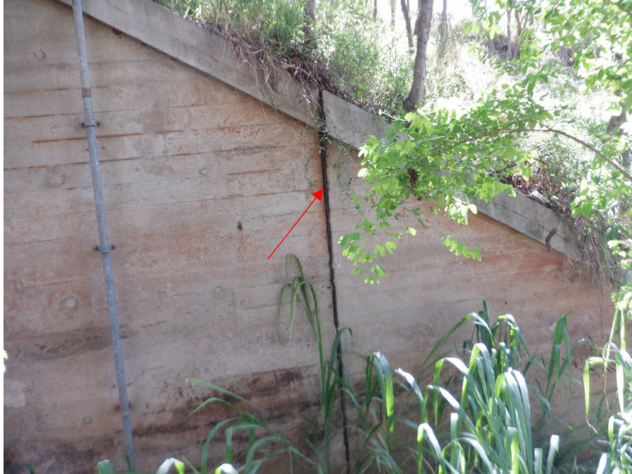
PHOTO 31 JOINT FILLER PROTRUDING FROM JOINT AT DOWNSTREAM EAST WINGWALL AND 1/2" GAP BETWEEN DOWNSTREAM EAST WINGWALL AND CHANNEL WALL