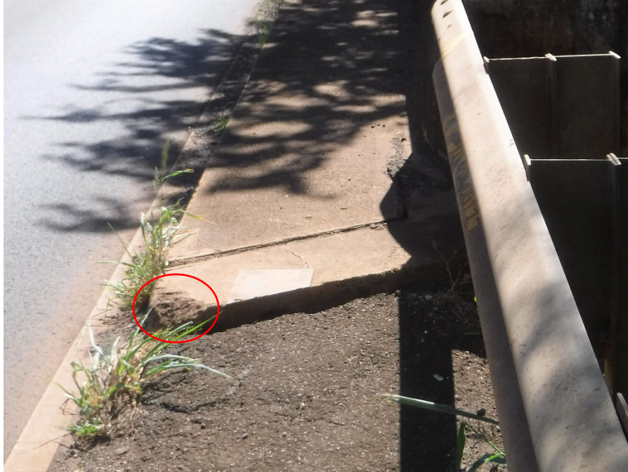
PHOTO 9 3" VERTICAL DIFFERENTIAL AND 1/2" GAP AT WEST APPROACH TO DOWSTREAM SIDEWALK AND 6"X6" EDGE SPALL ON CURB