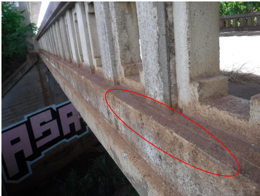
PHOTO 10 3'X4" DELAMINATION (3FT 1080 CS2) ON EXTERIOR FACE OF UPSTREAM BOTTOM RAIL NEAR WEST END OF BRIDGE