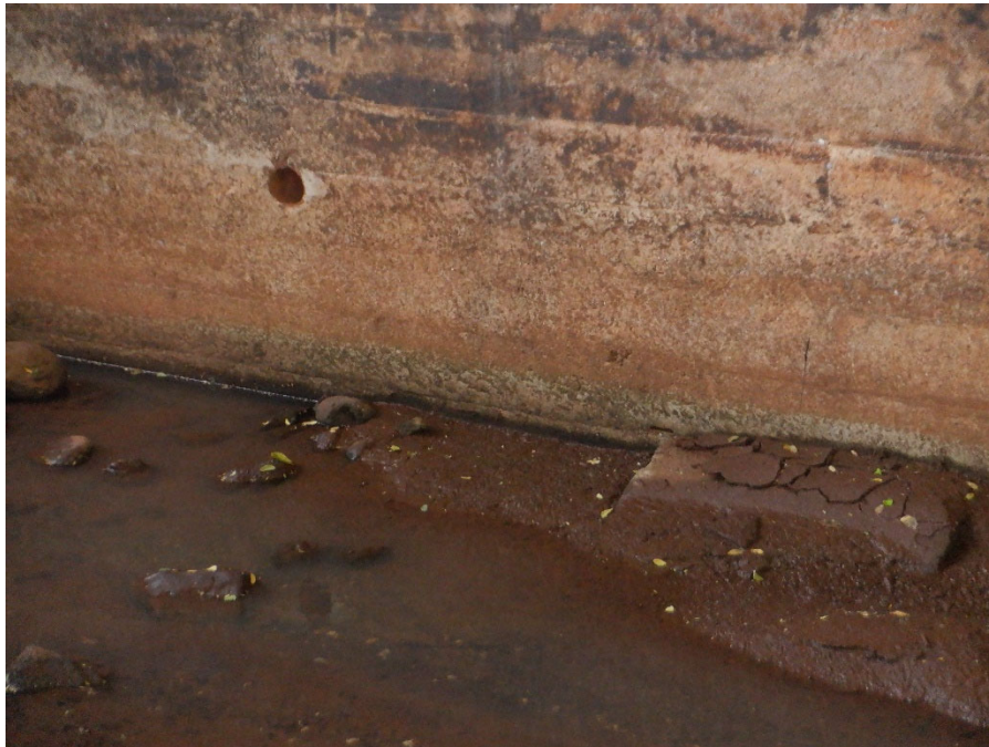
PHOTO 30 PARTIAL ABRASION (1190 CS2) ALONG ENTIRE LENGTH OF ABUTMENT 1 AND WINGWALLS