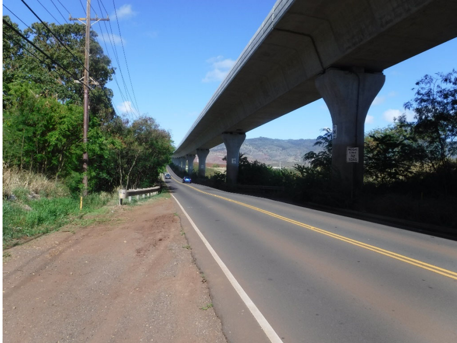
PHOTO 1 EAST APPROACH LOOKING WEST