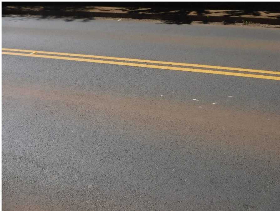
PHOTO 18 WEARING SURFACE