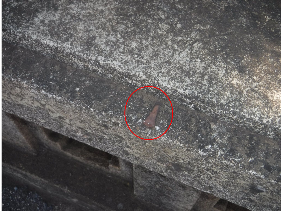
PHOTO 15 EXPOSED REBAR WITHOUT SECTION LOSS (1FT 1090 CS2) ON DOWNSTREAM BRIDGE RAILING