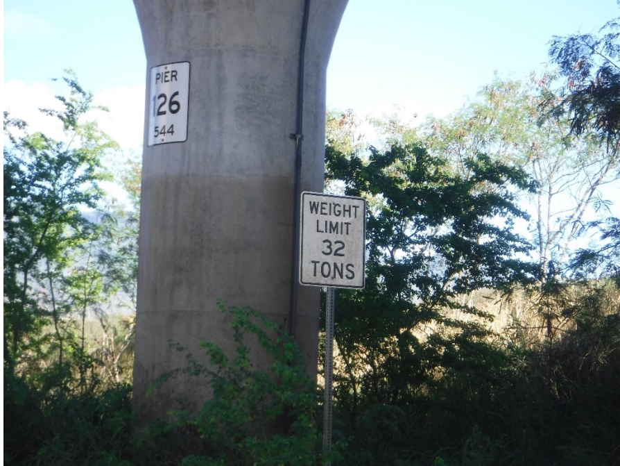
PHOTO 5 LOAD POSTING SIGN ON FARRINGTON HIGHWAY AT UPSTREAM EAST APPROACH TO BRIDGE