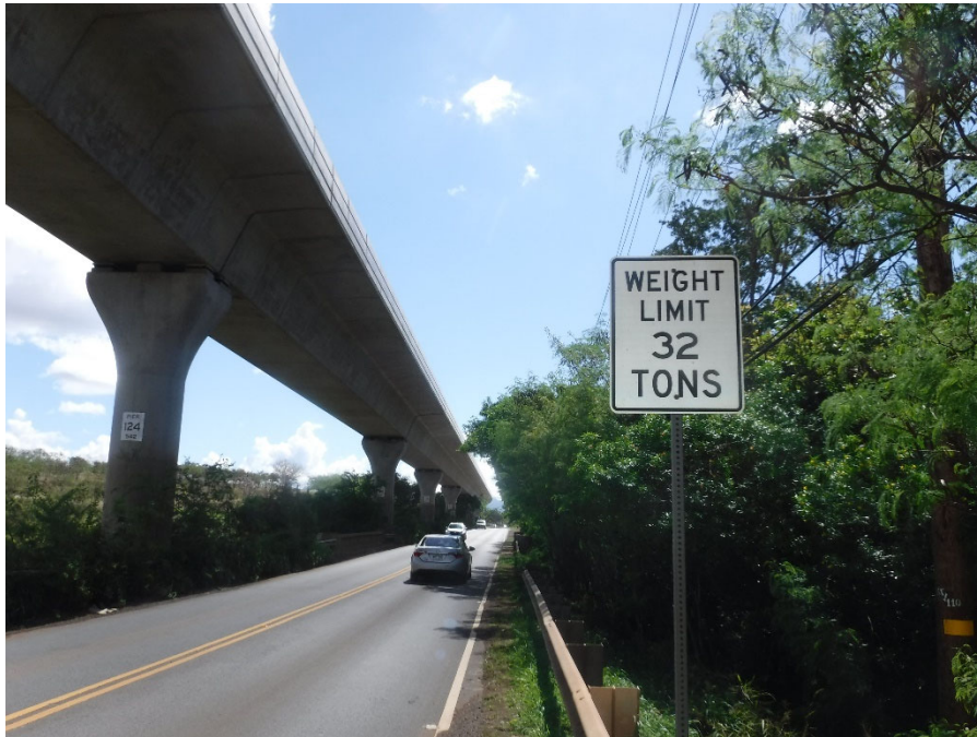
PHOTO 6 LOAD POSTING SIGN ON FARRINGTON HIGHWAY AT DOWNSTREAM WEST APPROACH TO BRIDGE