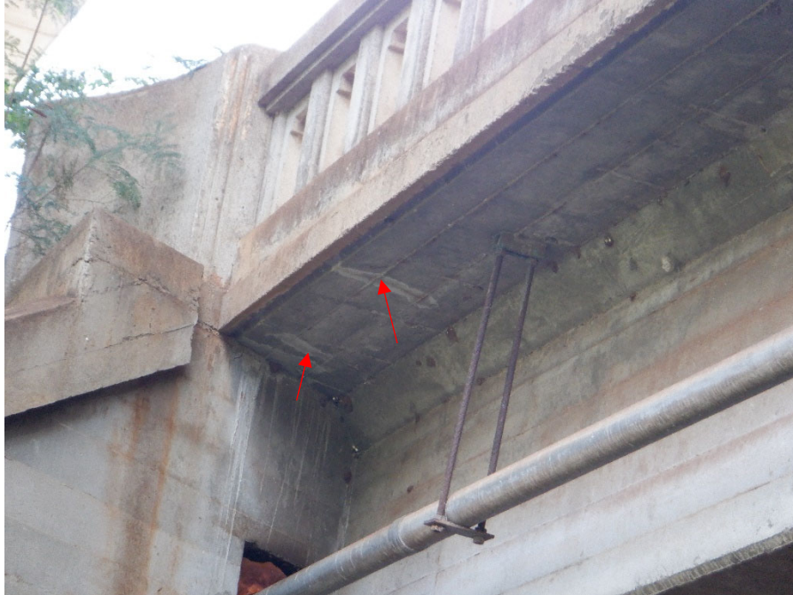
PHOTO 21 MODERATE WIDTH TRANSVERSE CRACKS WITH EFFLORESCENCE (3SF 1120 CS2) ON UPSTREAM CANTILEVER TOP FLANGE SOFFIT NEAR ABUTMENT 2