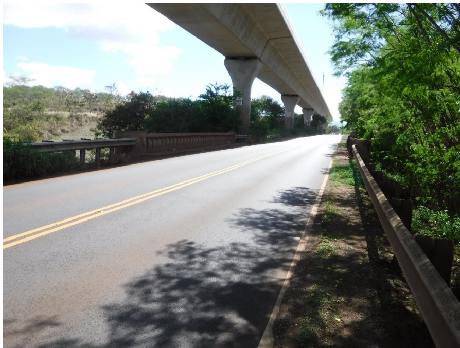
PHOTO 2 WEST APPROACH LOOKING EAST

Farrington Highway Bridge Over Honouliuli Stream Bridge No. 922 Structure No. 003922001100001