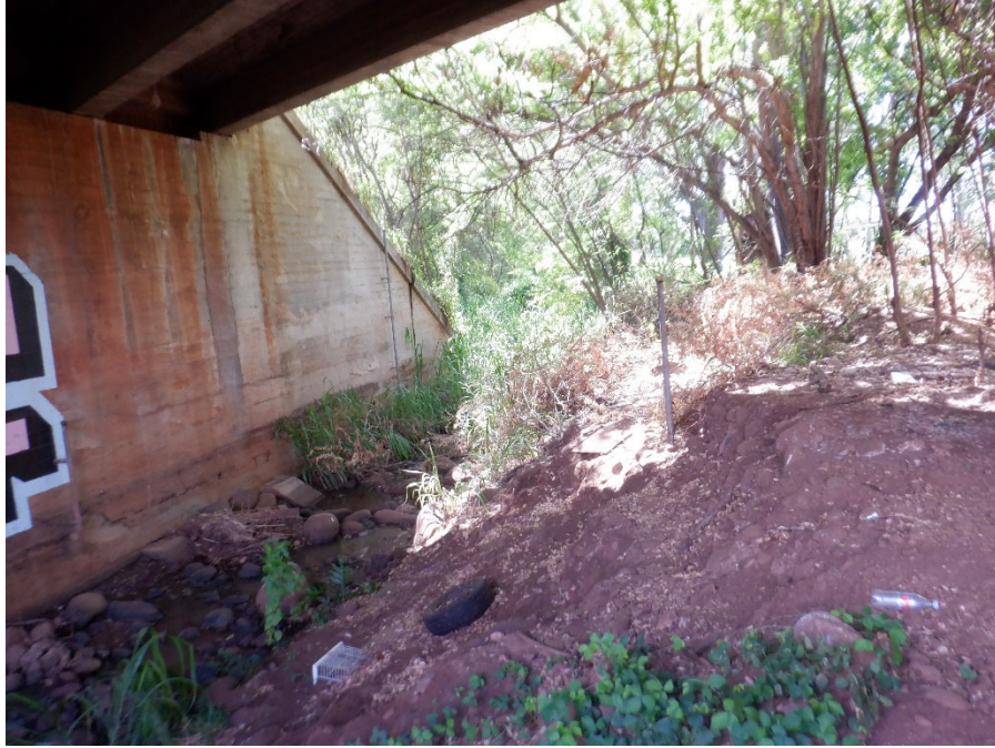
PHOTO 33 DOWNSTREAM CHANNEL WITH VEGETATION GROWTH