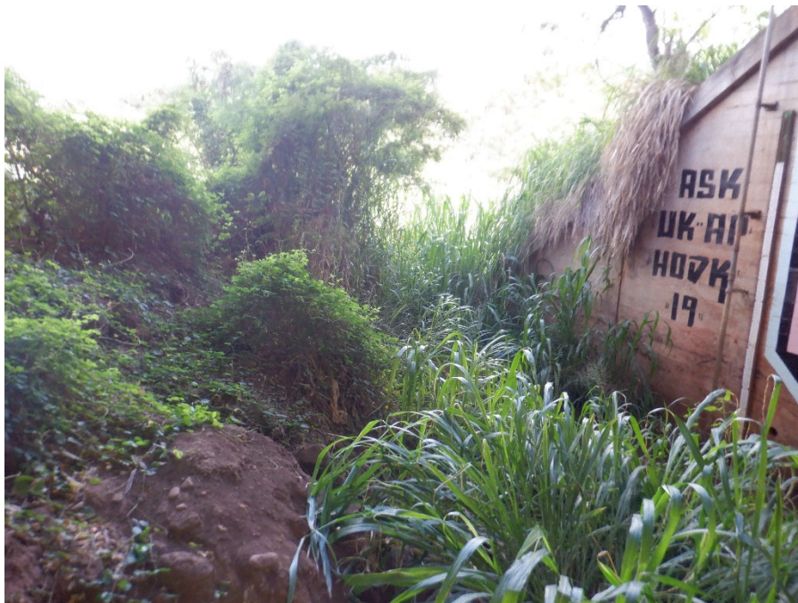
PHOTO 32 UPSTREAM CHANNEL WITH HEAVY VEGETATION GROWTH