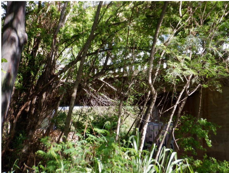
PHOTO 4 DOWNSTREAM ELEVATION