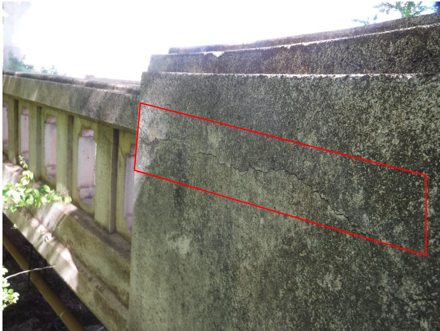
PHOTO 14 4FT LONG HORIZONTAL CRACK AND DELAMINATION (4FT 1080 CS2) ON EXTERIOR FACE OF DOWNSTREAM EAST END POST