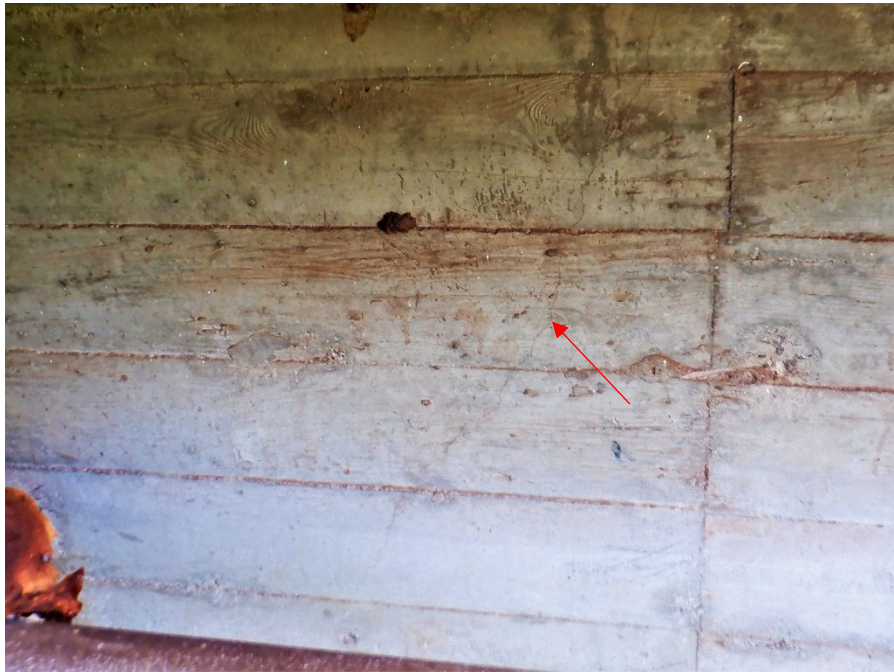
PHOTO 24 TYPICAL MODERATE WIDTH DIAGONAL CRACK (1130 CS2) ON ALL GIRDERS