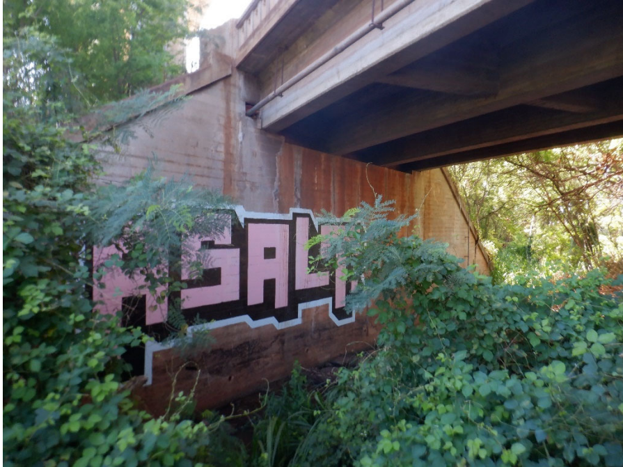
PHOTO 25 ABUTMENT 1