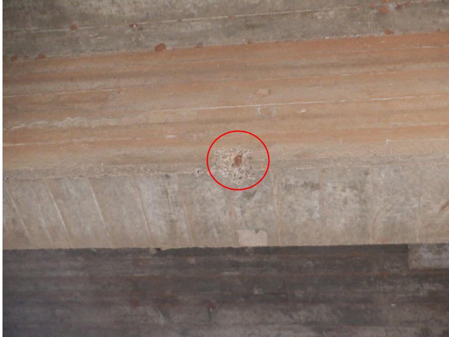
PHOTO 23 4"X4" EDGE SPALL WITH EXPOSED REBAR WITHOUT SECTION LOSS (1FT 1090 CS2) ON GIRDER G3