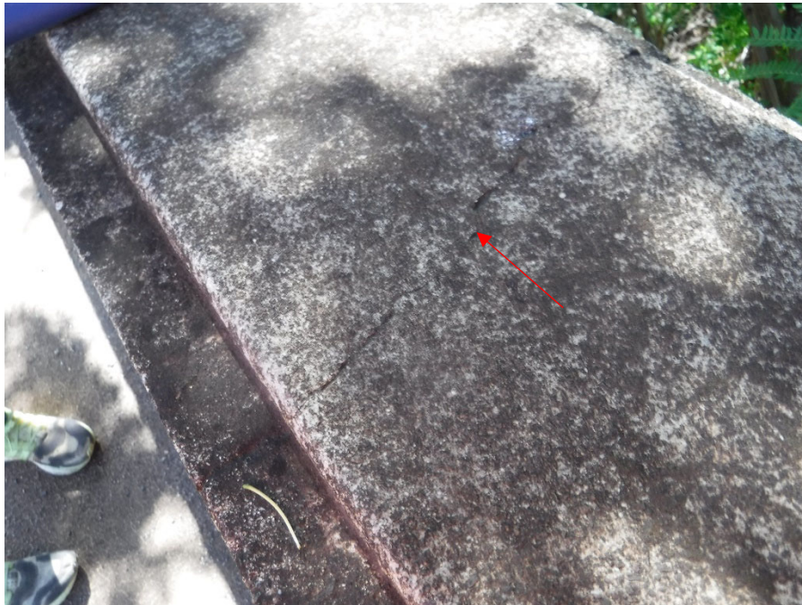
PHOTO 16 TYPICAL MODERATE WIDTH CRACK (1130 CS2) ON BOTH BRIDGE RAILINGS