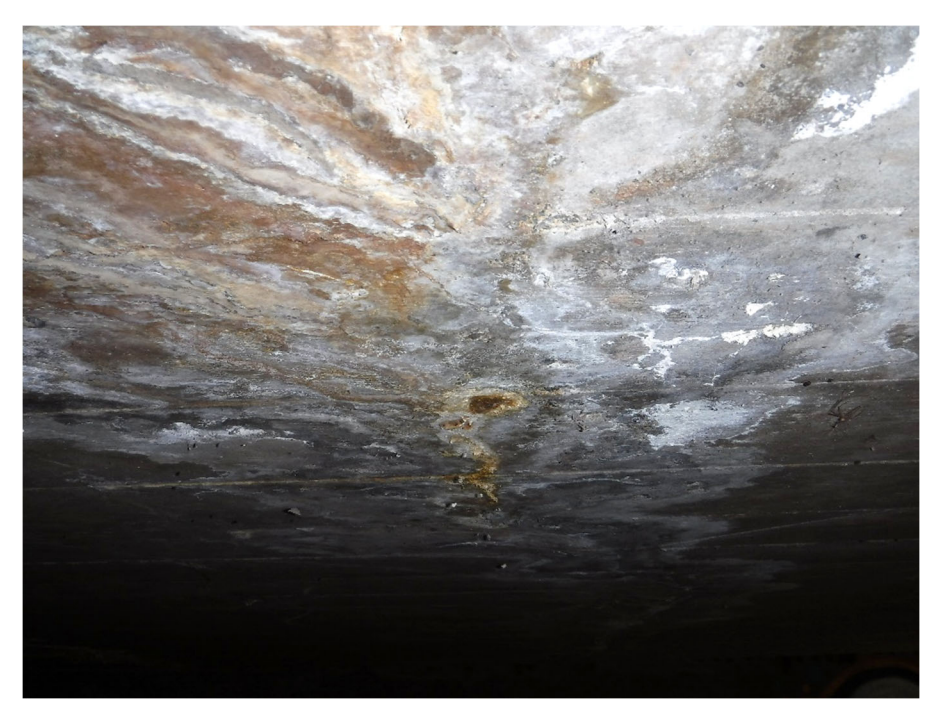
PHOTO 15 LONGITUDINAL CRACK WITH BUILT-UP EFFLORESCENCE (25SF 1120 CS3) ON SLAB SOFFIT, 28' FROM UPSTREAM SIDE