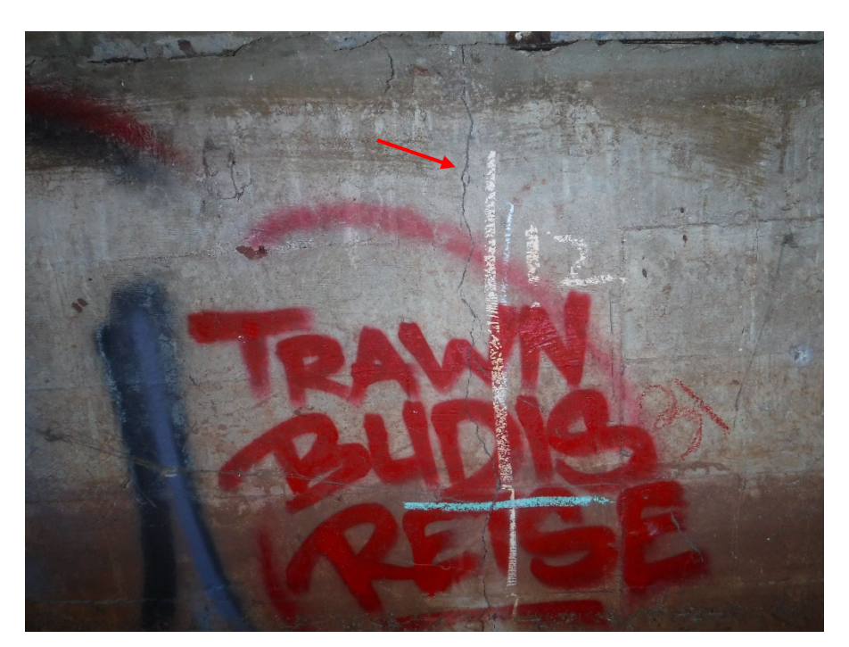
PHOTO 22 WIDE CRACK (1FT 1130 CS3) ON ABUTMENT 1, 45' FROM UPSTREAM END