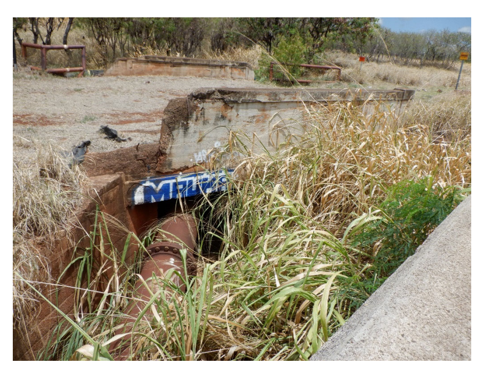
PHOTO 24 UPSTREAM CHANNEL WITH HEAVY VEGETATION AND EXISTING ABANDONED BRIDGE