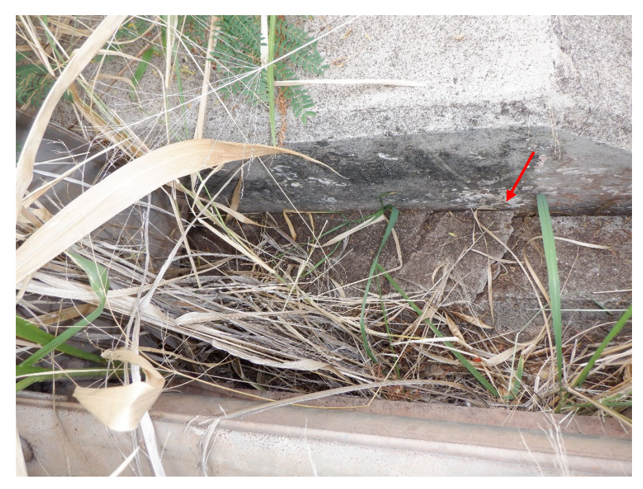
PHOTO 13 2'X1' DELAMINATION ON CURB AT BASE OF DOWNSTREAM CONCRETE BRIDGE RAILING, NEAR WEST END OF BRIDGE