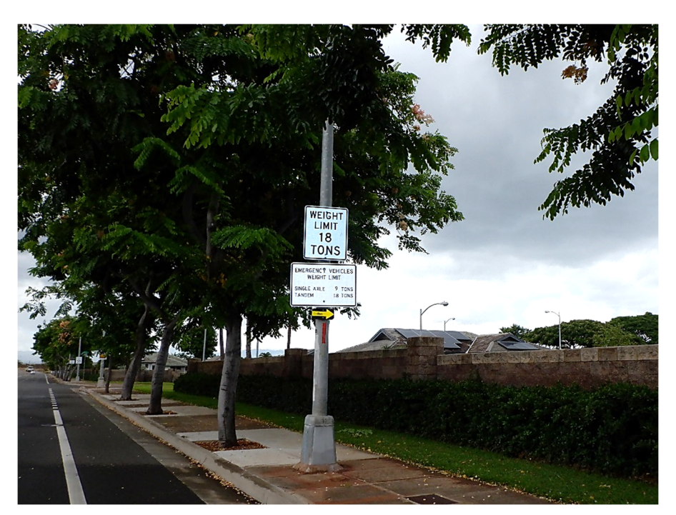
PHOTO 6 LOAD POSTING SIGNS ON FARRINGTON HIGHWAY, WEST OF KOWELO AVENUE