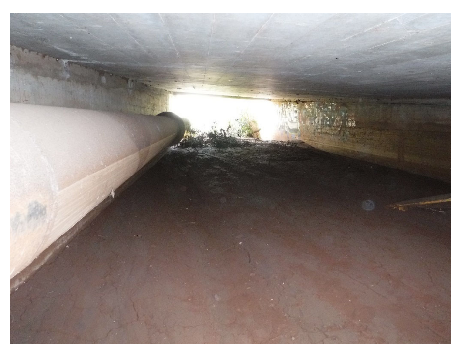
PHOTO 23 STREAM CHANNEL UNDER BRIDGE LOOKING UPSTREAM, WITH UTILITY PIPE ALONG ABUTMENT 2