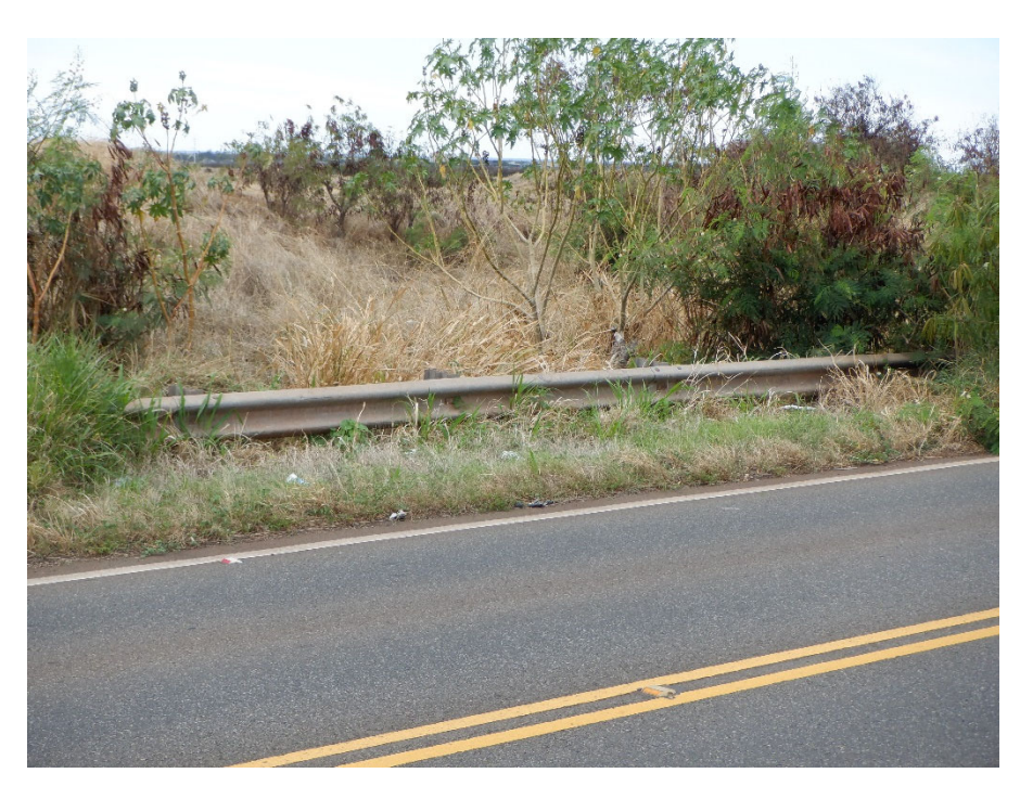
PHOTO 12 METAL GUARDRAIL ATTACHED TO DOWNSTREAM CONCRETE BRIDGE RAILING