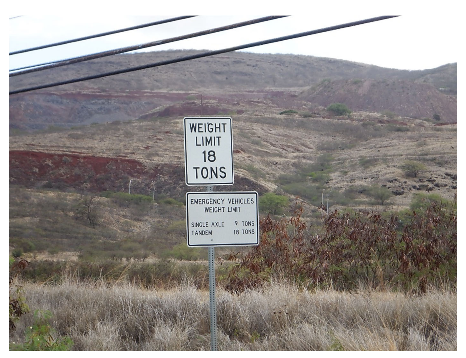
PHOTO 5 LOAD POSTING SIGNS ON FARRINGTON HIGHWAY AT EAST APPROACH TO BRIDGE