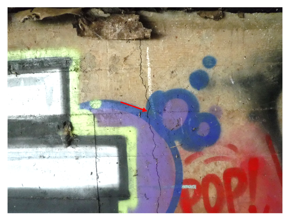
PHOTO 21 WIDE CRACK (1FT 1130 CS3) ON ABUTMENT 1, 25' FROM UPSTREAM END