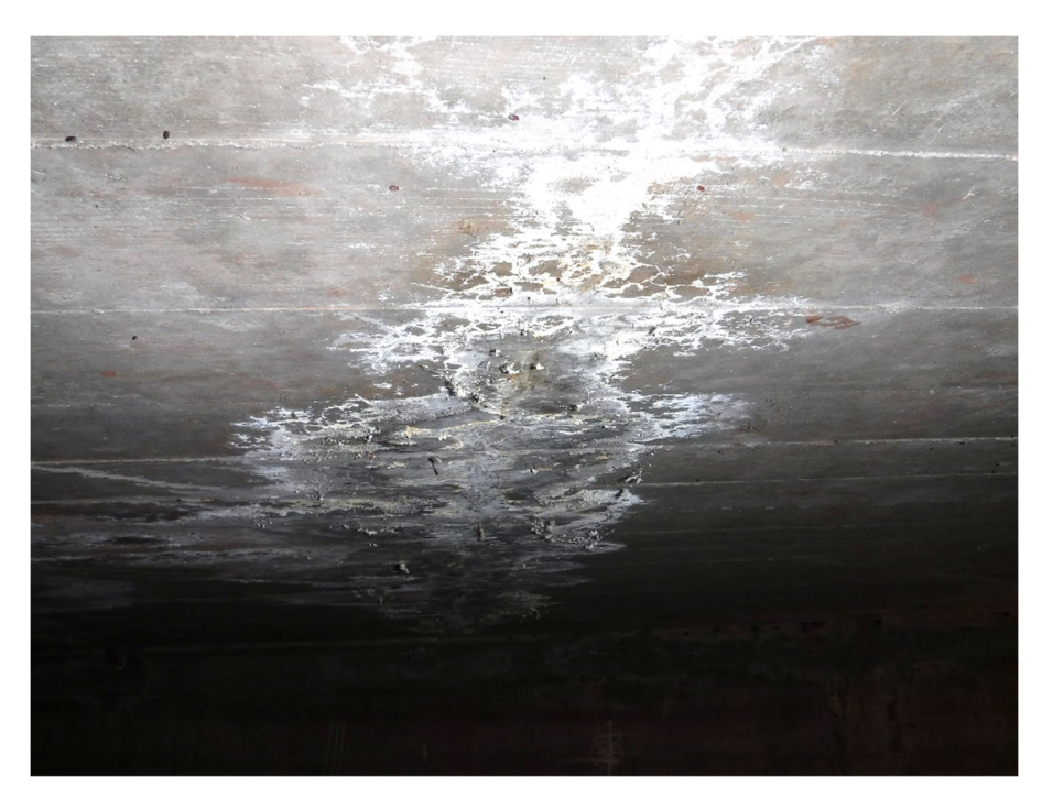
PHOTO 16 LONGITUDINAL CRACK WITH BUILT-UP EFFLORESCENCE (25SF 1120 CS3) ON SLAB SOFFIT, 30' FROM UPSTREAM SIDE