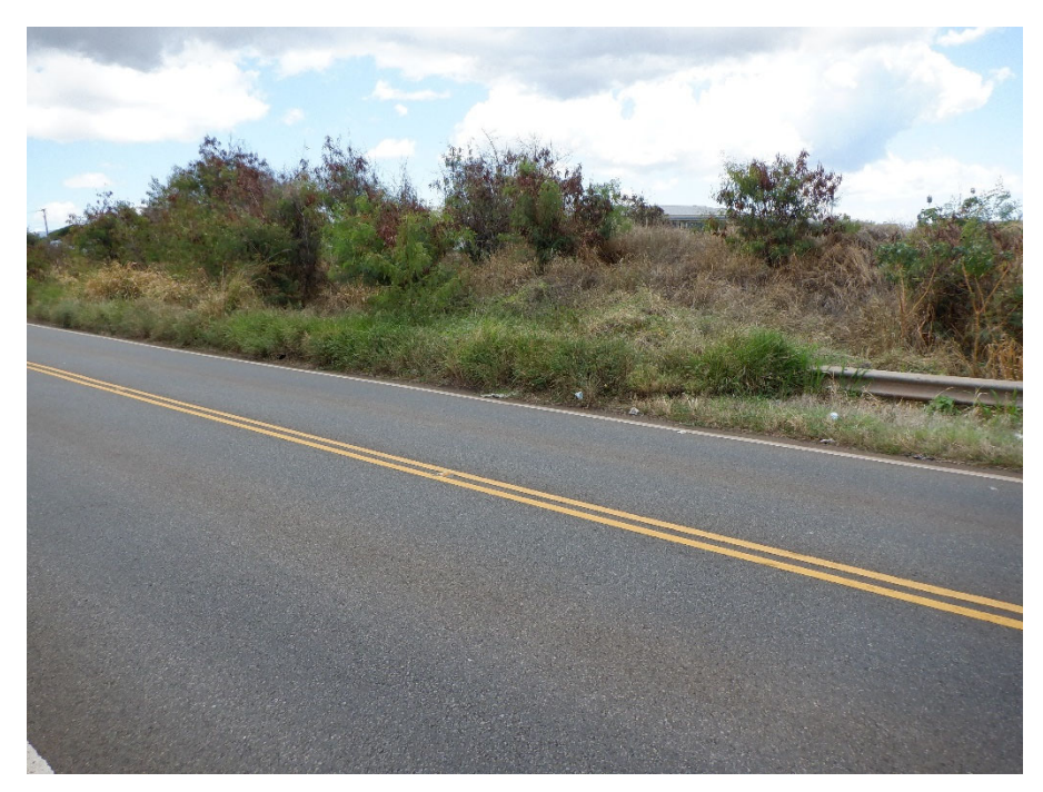
PHOTO 9 DOWNSTREAM EAST APPROACH GUARDRAIL COVERED BY HEAVY VEGETATION