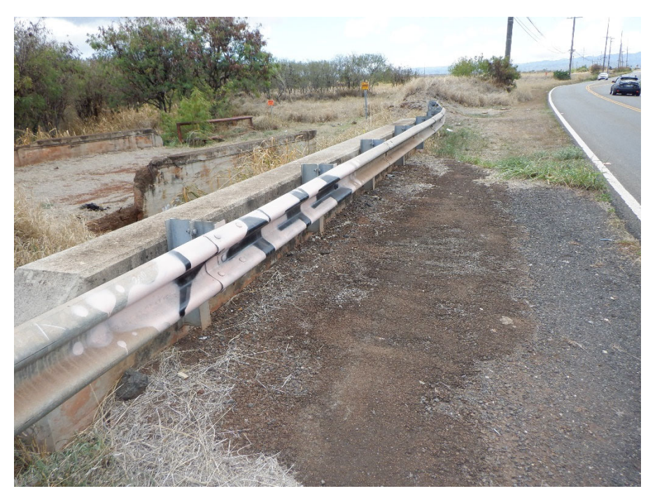
PHOTO 11 METAL GUARDRAIL ATTACHED TO UPSTREAM CONCRETE BRIDGE RAILING