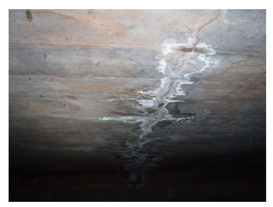
PHOTO 18 LONGITUDINAL CRACK WITH BUILT-UP EFFLORESCENCE (25SF 1120 CS3) ON SLAB SOFFIT, 45' FROM UPSTREAM SIDE