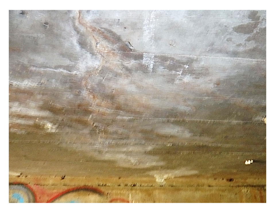
PHOTO 17 LONGITUDINAL CRACK WITH BUILT-UP EFFLORESCENCE (25SF 1120 CS3) ON SLAB SOFFIT, 32' FROM UPSTREAM SIDE