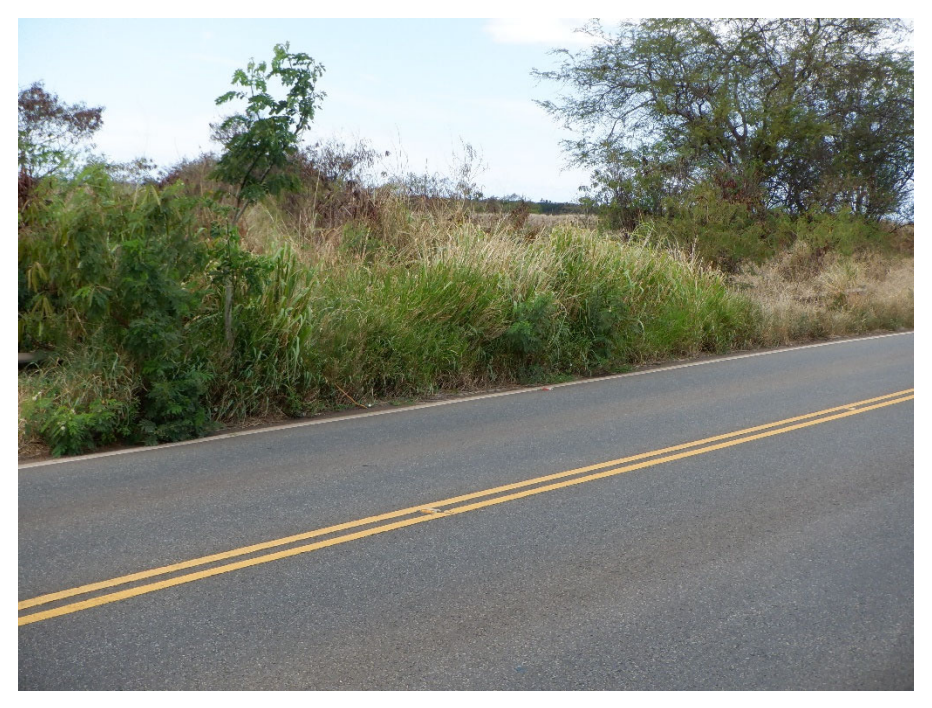
PHOTO 10 DOWNSTREAM WEST APPROACH GUARDRAIL COVERED BY HEAVY VEGETATION