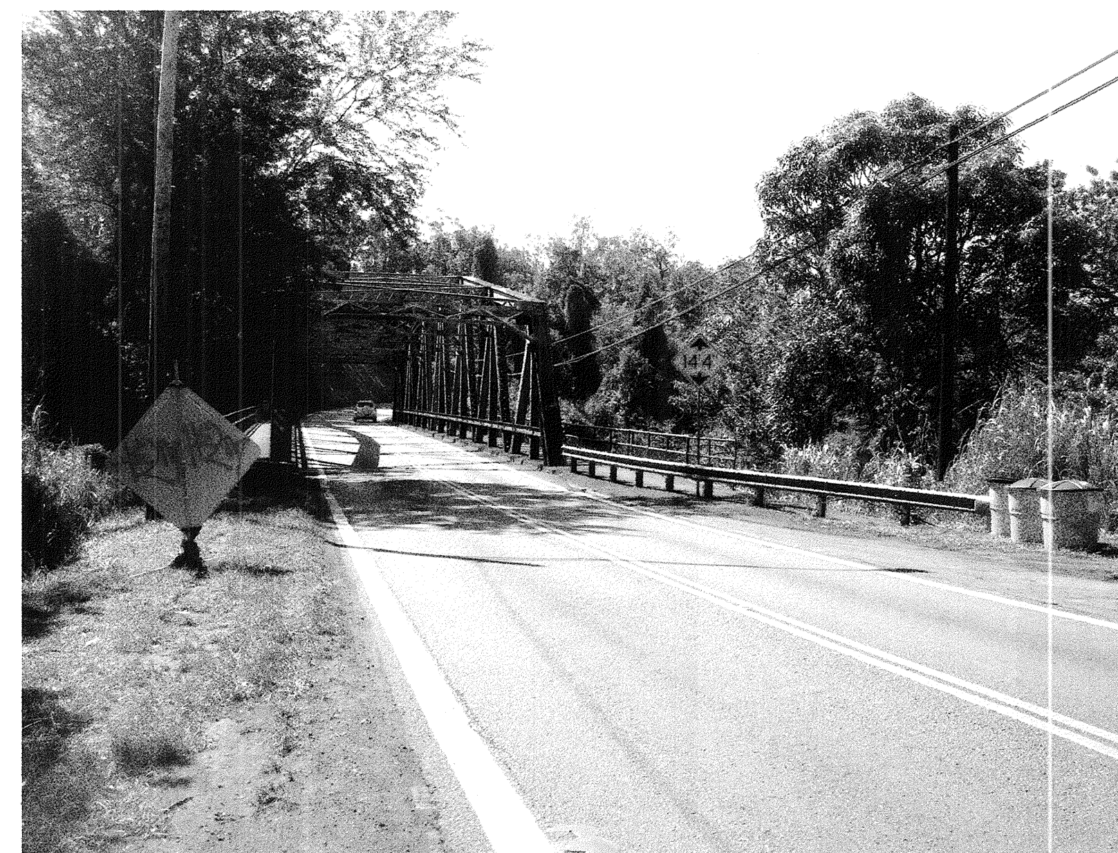
4 / T9/T7 BRIDGE APPROACH - HALEIWA SIDE