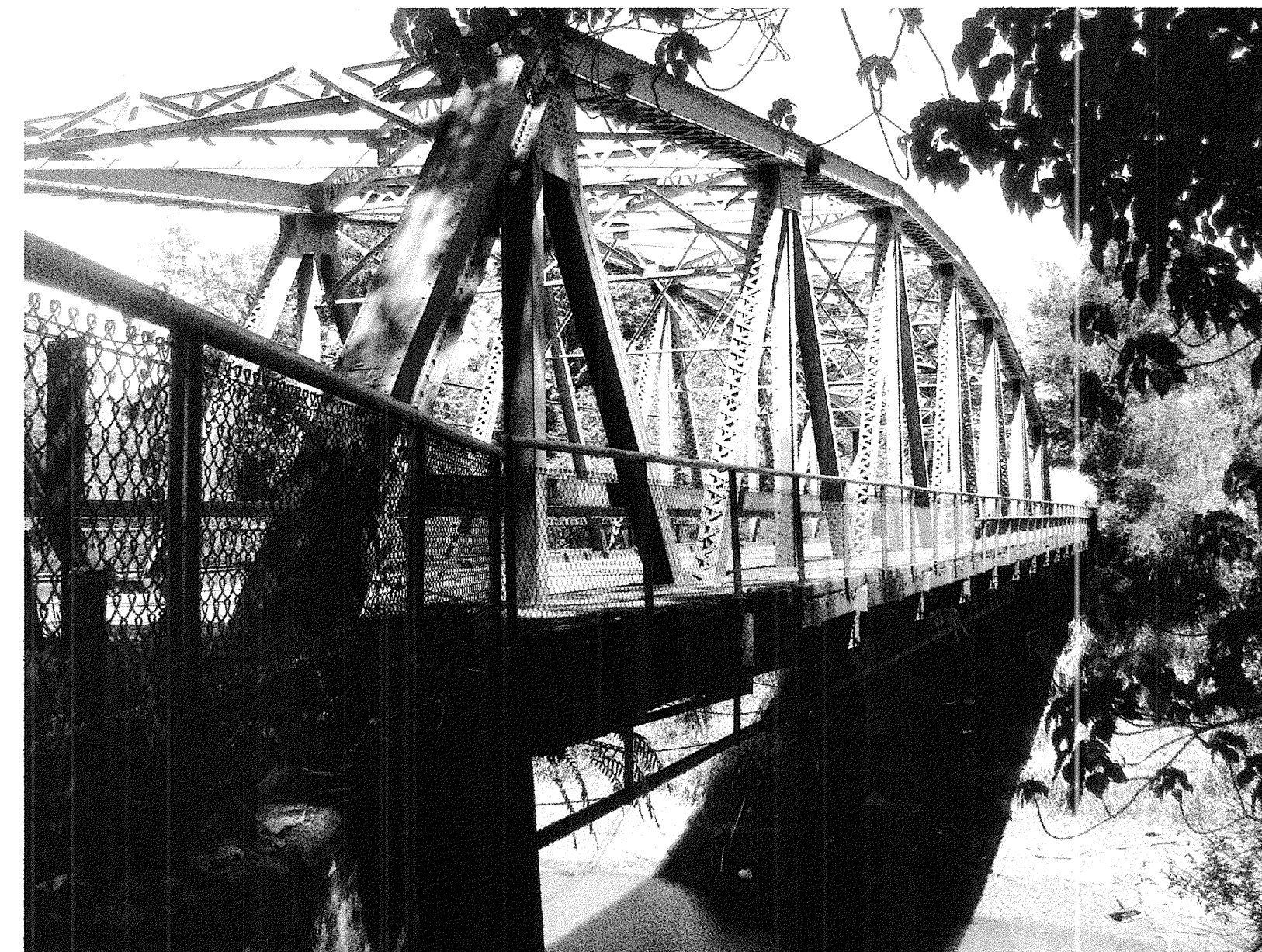
2 / T9/T7 UPSTREAM VIEW OF KARSTEN THOT BRIDGE