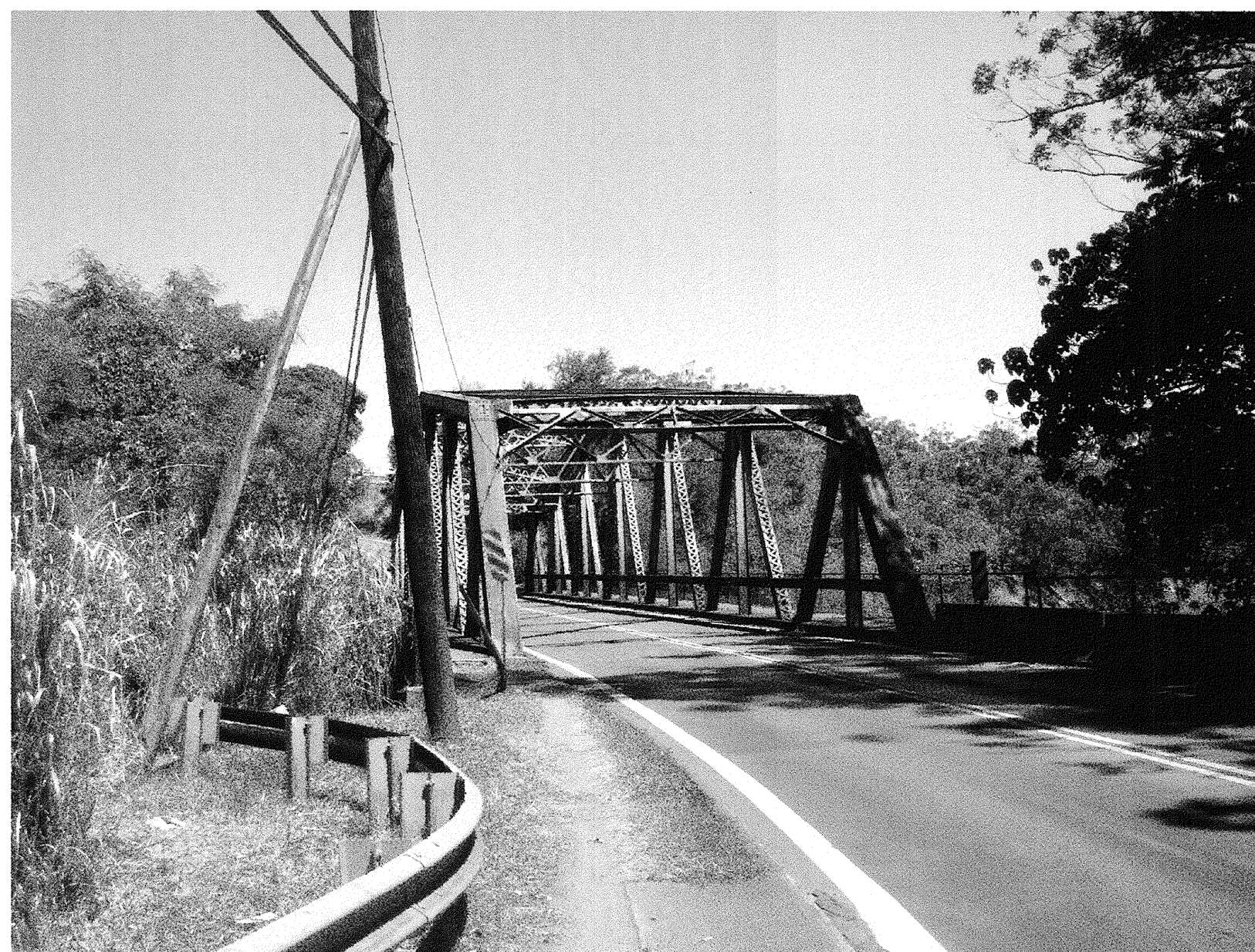
3 / T9/T7 BRIDGE APPROACH - HONOLULU SIDE