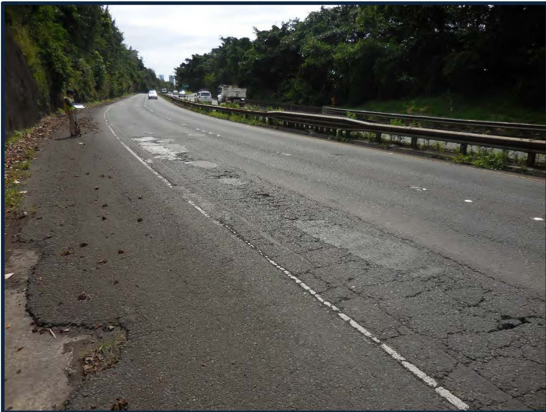
Photo No. 6: Heavy rutting, alligator cracking, and pothole patches under vehicle wheel path.