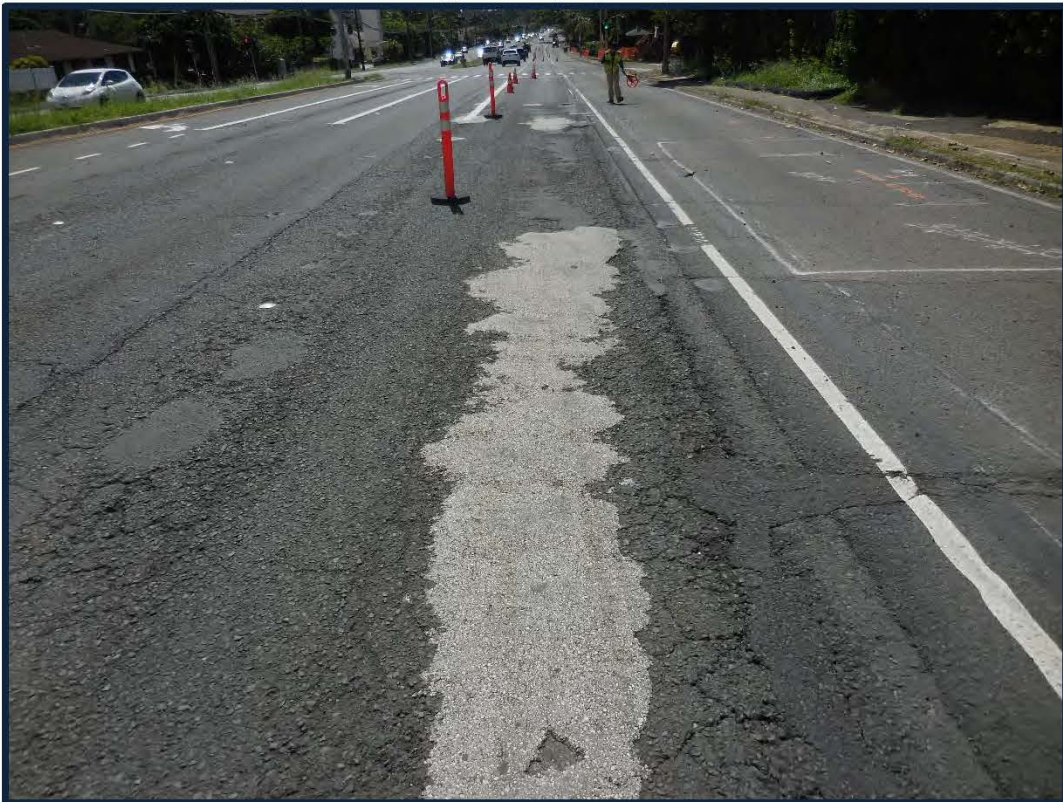
Photo No. 8: Surface raveling, alligator cracking, and large asphalt and concrete patches.