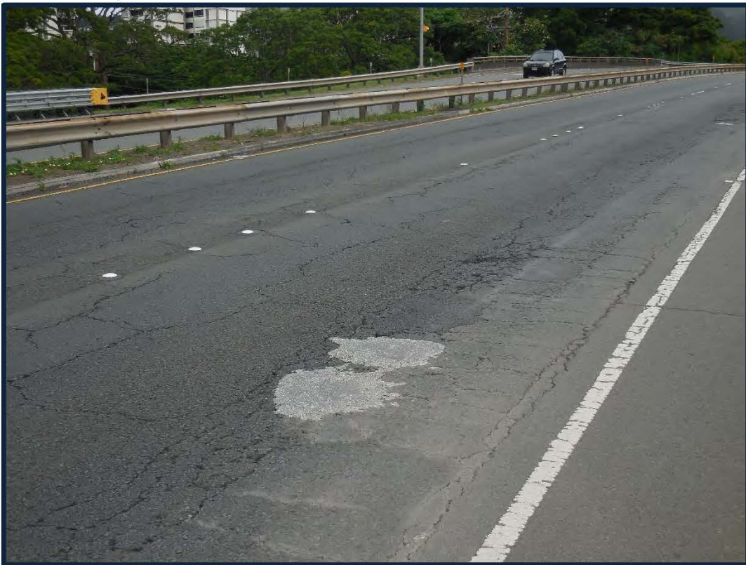
Photo No. 4: Alligator cracking, block cracking, asphalt and concrete pothole patches, and subgrade failure.