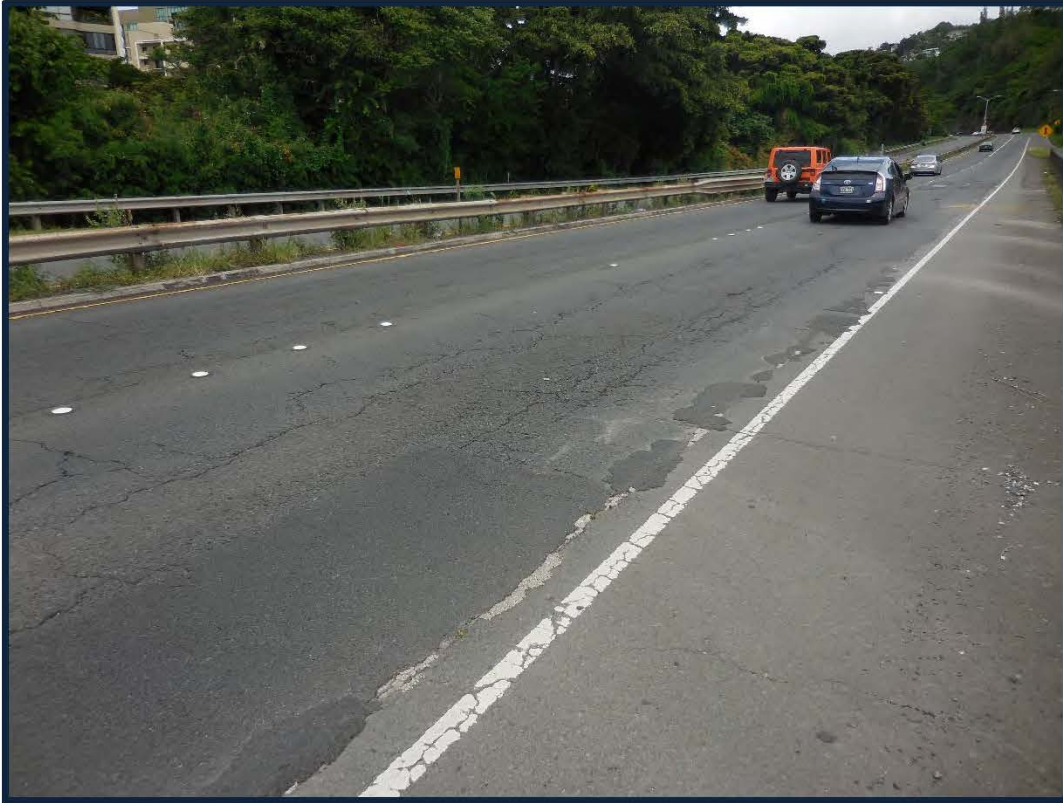
Photo No. 5: Longitudinal cracking, large asphalt and concrete patches, and subgrade failure.