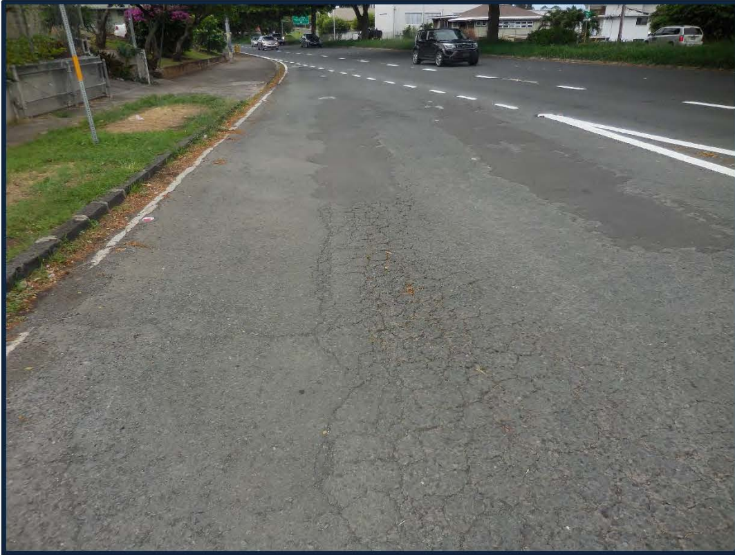
Photo No. 3: Heavy alligator cracking and asphalt concrete patches under vehicle wheel paths.