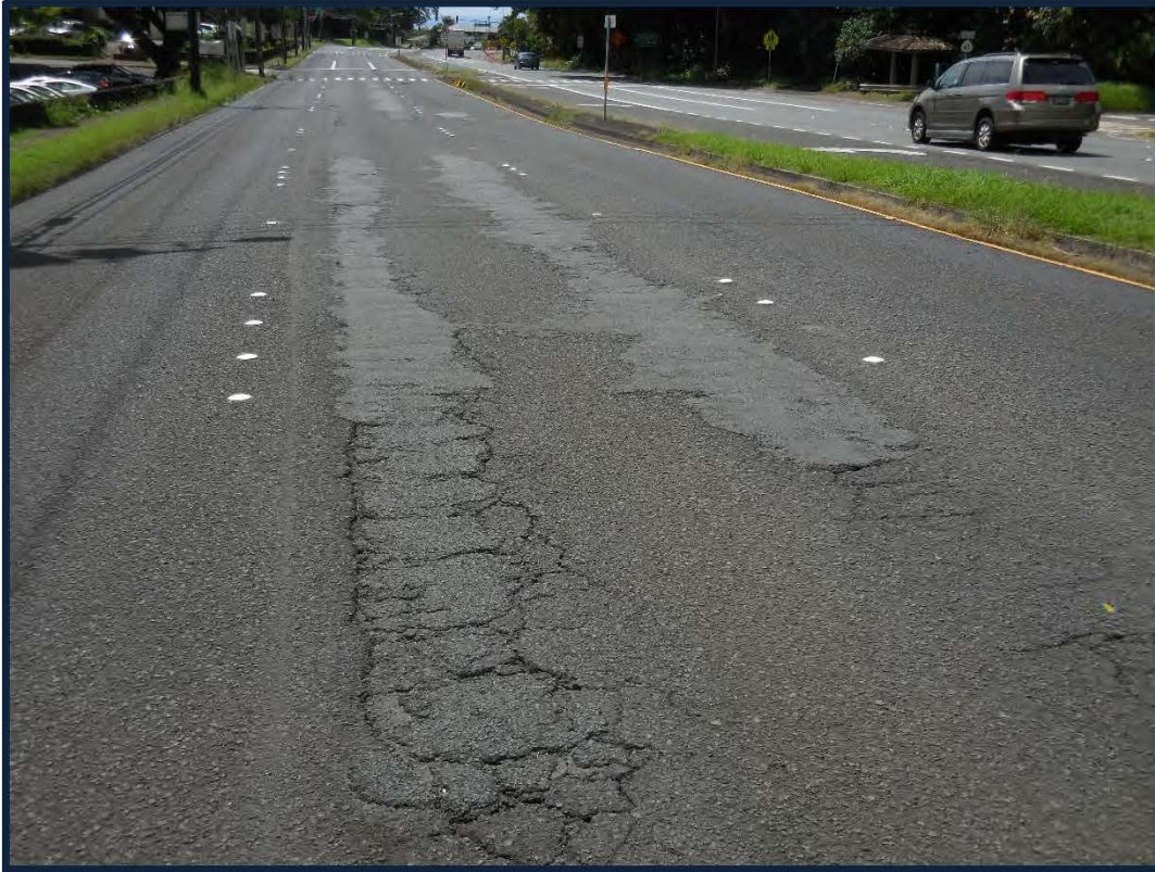
Photo No. 7: Rutting, alligator cracking, and long asphalt patches under vehicle wheel paths.