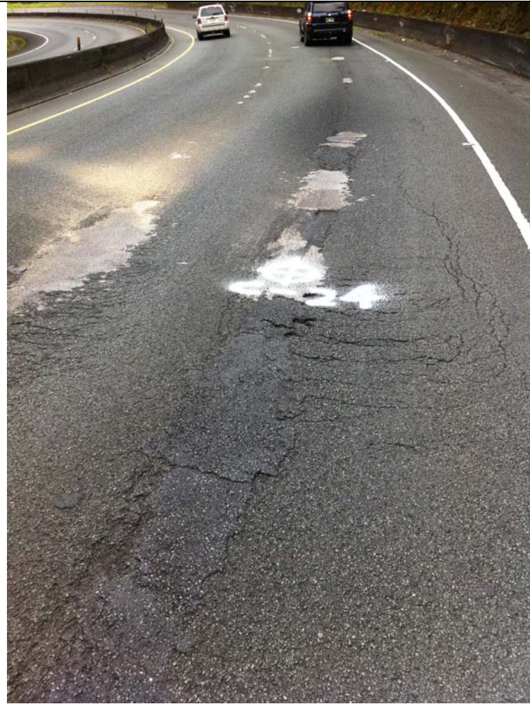
Photograph No. 8: Severely distressed pavements with rutting, shoving, and cracking.