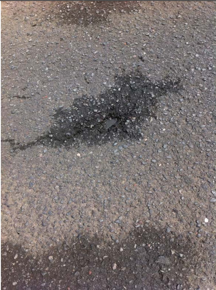
Photograph No. 5: Pothole exhibiting shallow subterranean seepage.