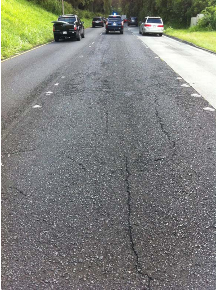
Photograph No. 1: Existing pavements with alligator cracking (fatigue) and minor block cracking.