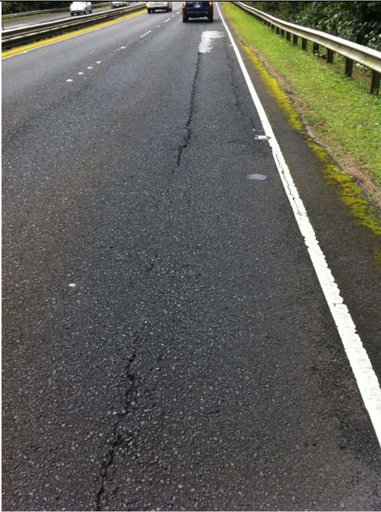
Photograph No. 7: Existing pavements exhibiting longitudinal cracking.