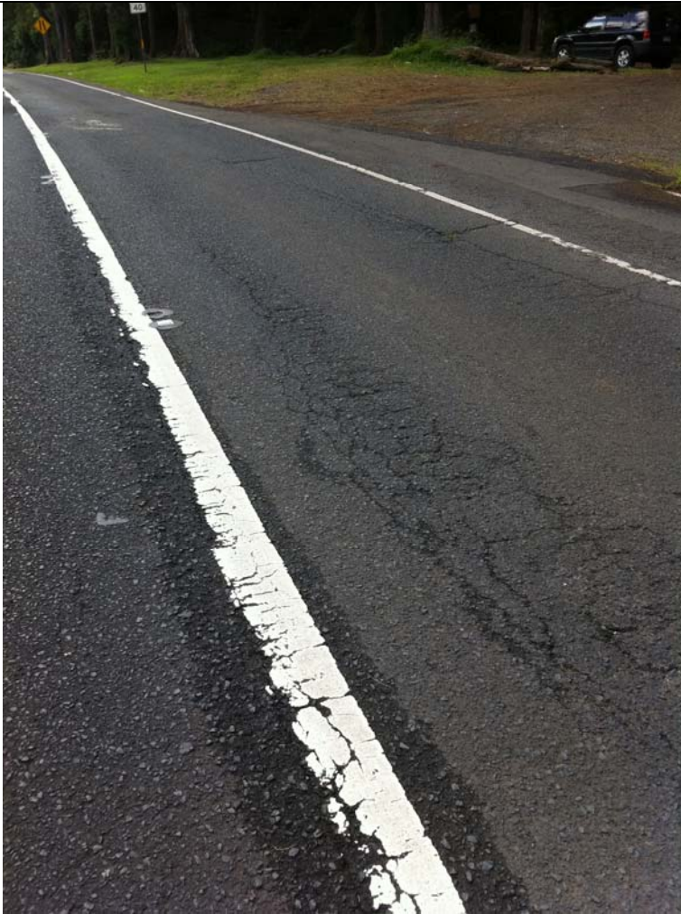
Photograph No. 3: Rutting and depression along wheel path.