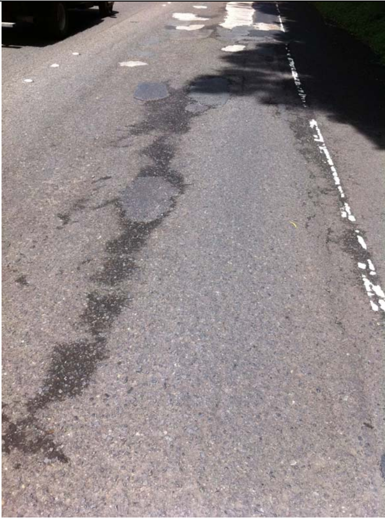
Photograph No. 9: Distressed pavements with multiple asphalt and concrete patches.