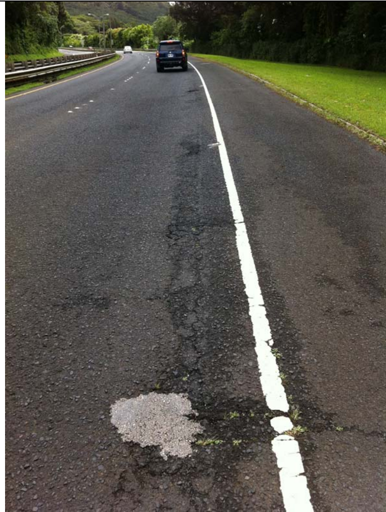
Photograph No. 6: Fatigue cracking along edge of travel lane and shoulder area.