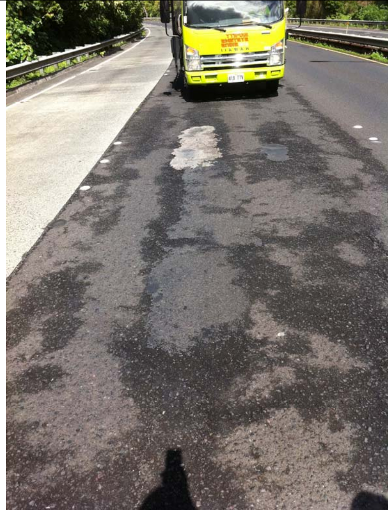
Photograph No. 2: Deteriorated pavements with asphalt and concrete patches.