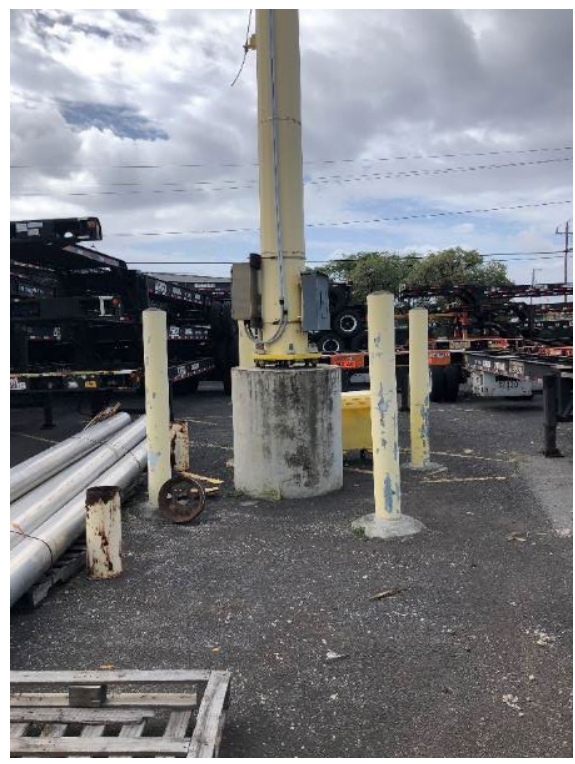
Photo 9: Light Pole 53-19 with Panelboard and Matson-Owned Telecommunications Cabinet