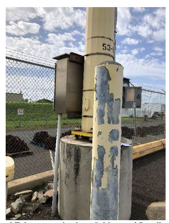
Photo 4: Matson-Owned Telecommunications Cabinet and Panelboard at Light Pole 53-8