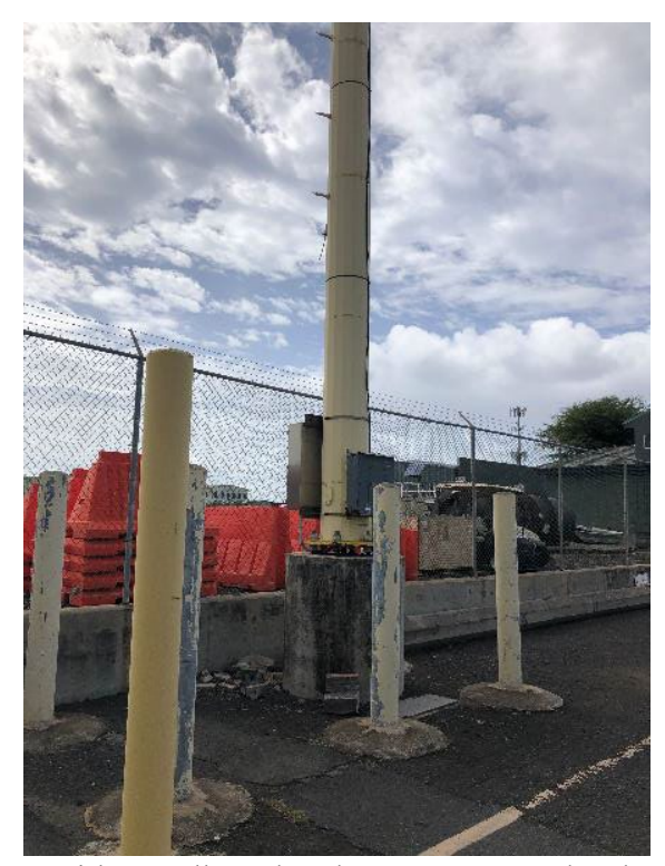
Photo 7: Light Pole 53-15 with Panelboard and Matson-Owned Telecommunications Cabinet