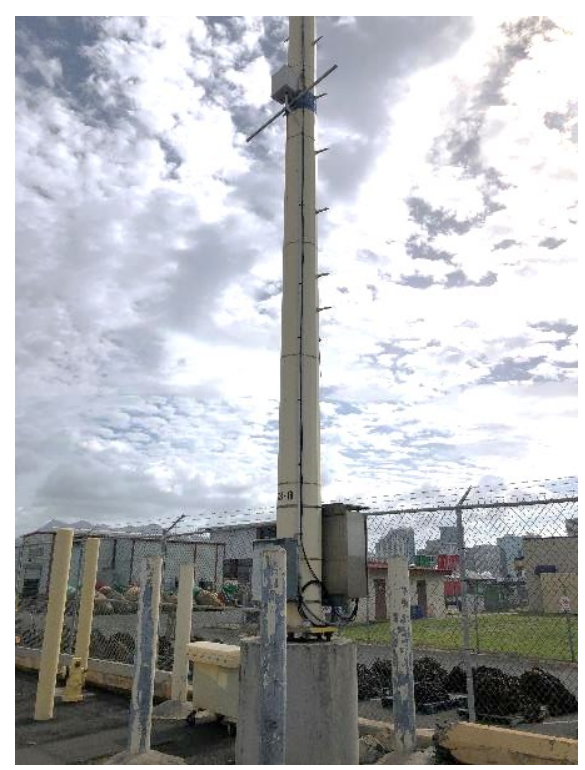
Photo 3: Light Pole 53-8 with Matson-Owned Telecommunications Cabinet