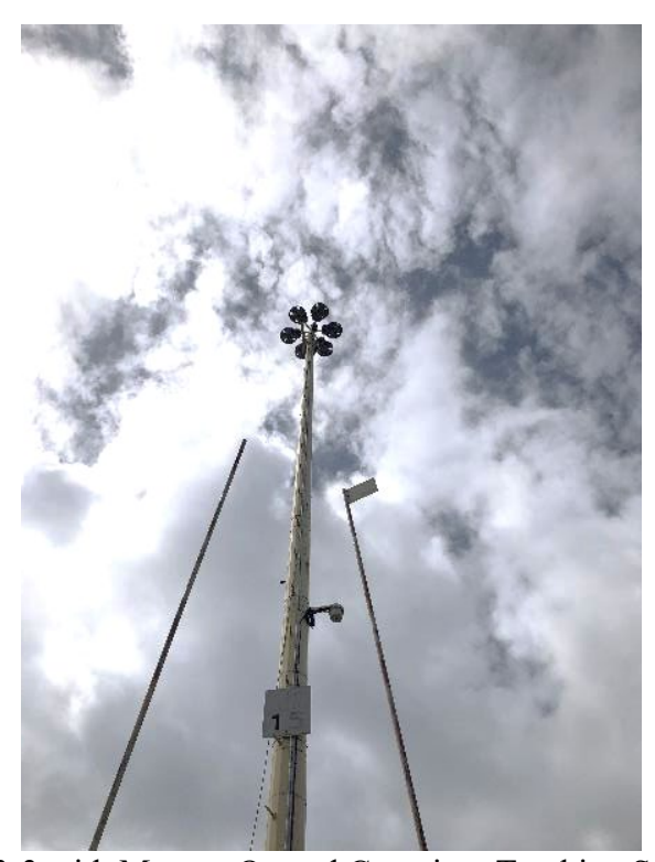
Photo 2: Light Pole 53-3 with Matson-Owned Container Tracking System and Transceiver