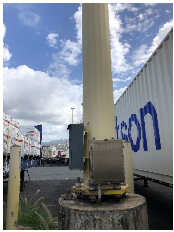
Photo 6: Light Pole 53-14 with Panelboard and Matson-Owned Fiber Splice Box