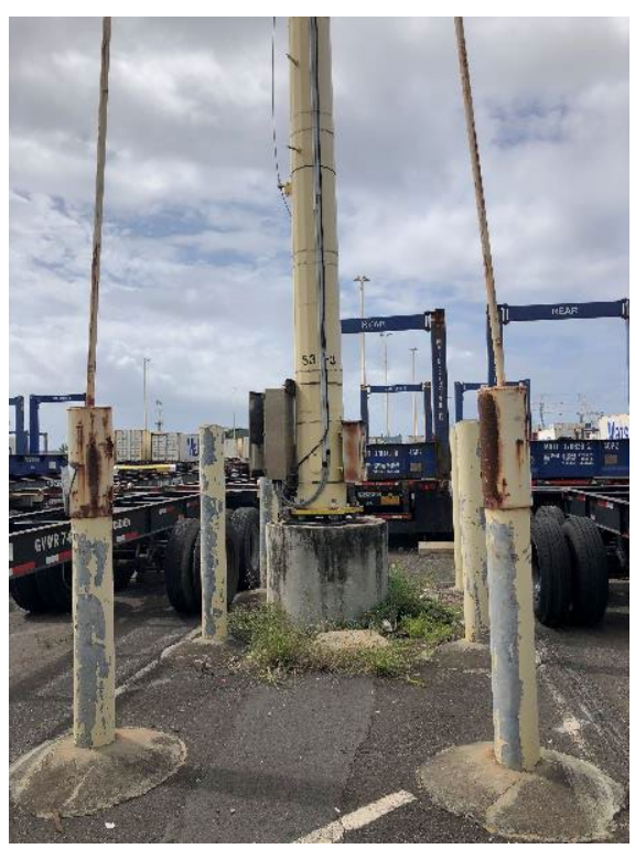
Photo 1: Light Pole 53-3 with Panelboard and Matson-Owned Telecommunications Cabinet