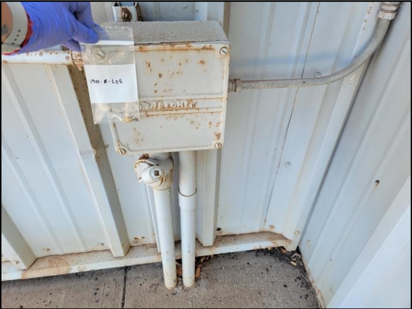
Photograph 6: Grey paint on repair shop exterior conduit and junction box Sample ID 1901-R-L03