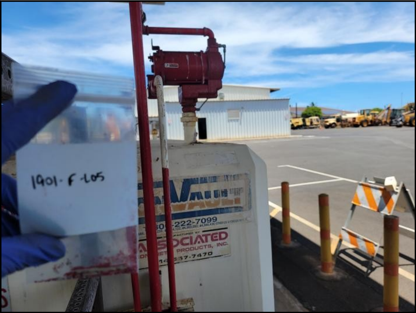
Photograph 2: Red paint on fuel tank motor and pipes Sample ID 1901-F-L05