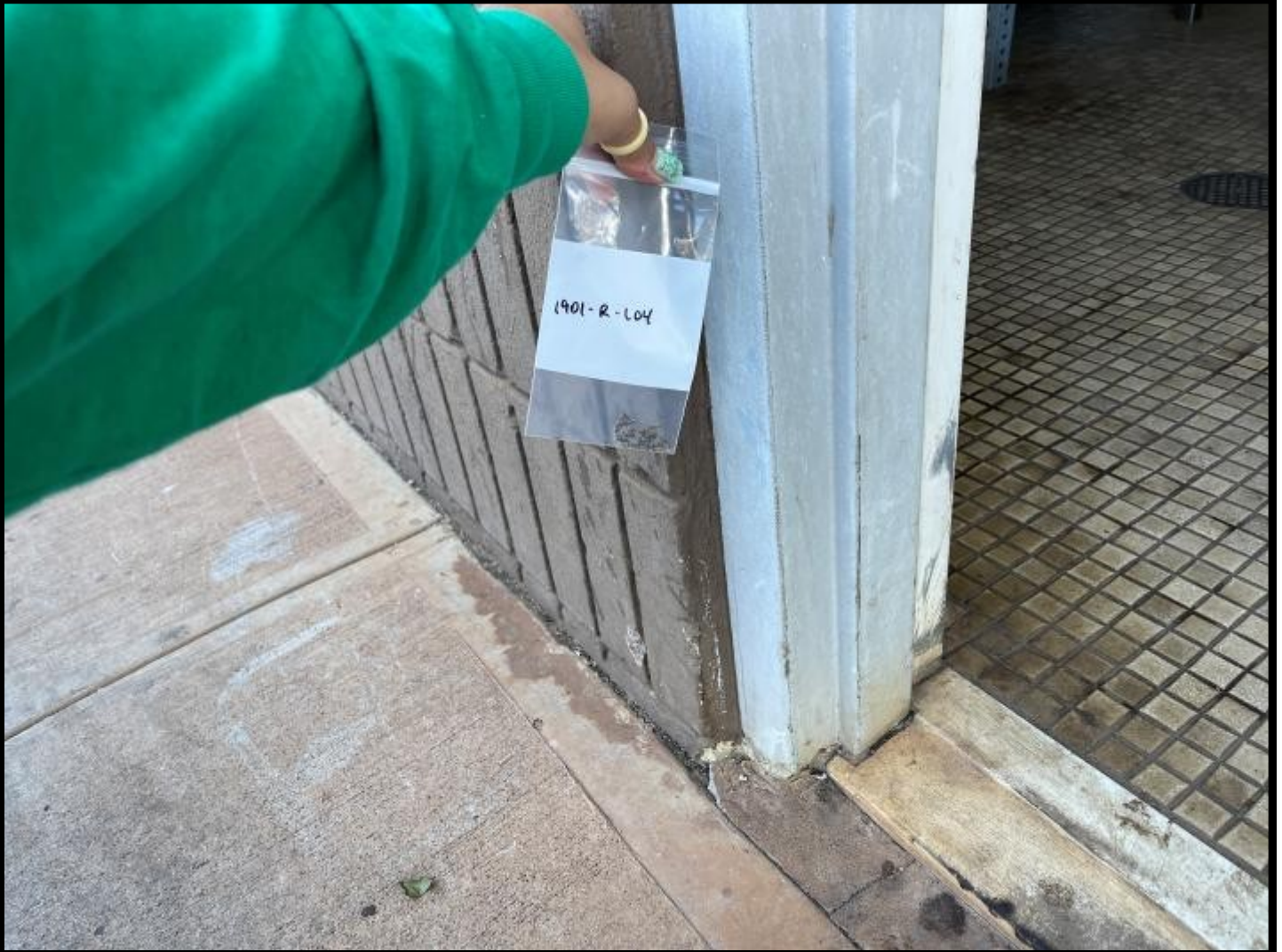
Photograph 7: Brown paint on repair shop exterior CMU walls Sample ID 1901-R-L04