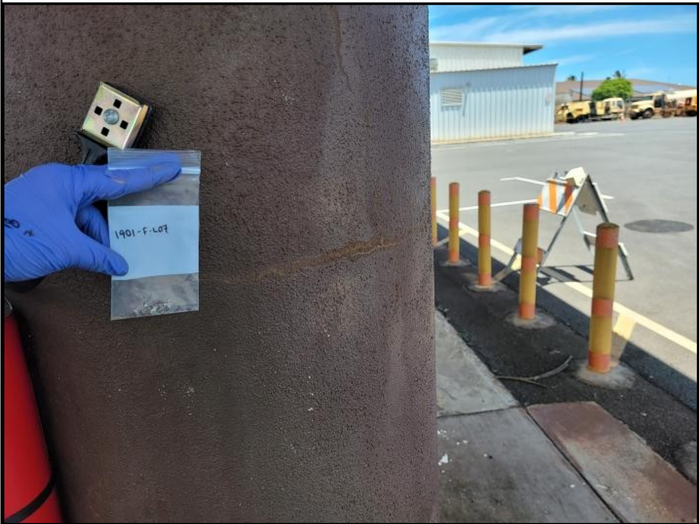
Photograph 3: Brown paint on fuel station canopy pillars Sample ID 1901-F-L07