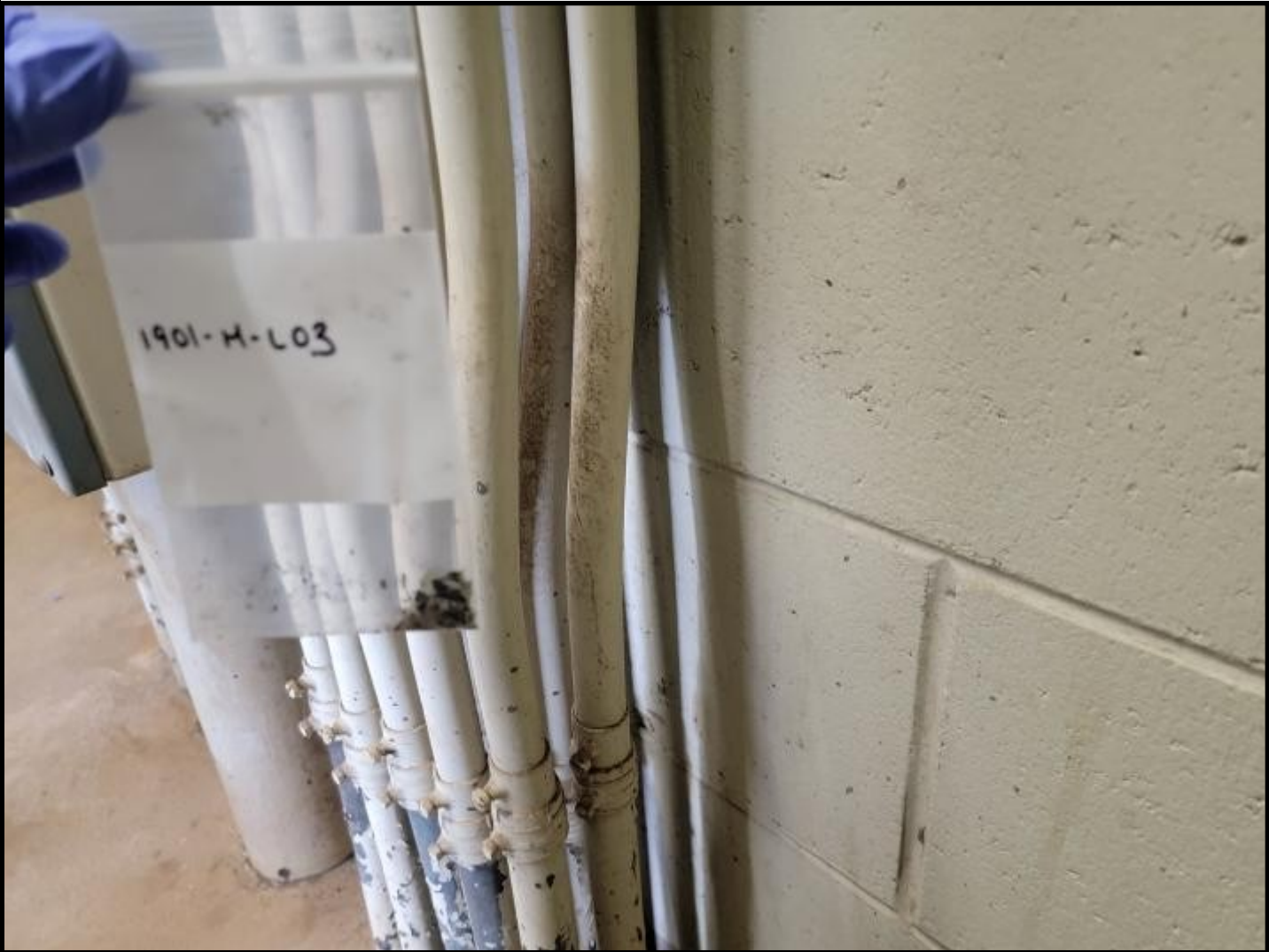
Photograph 4: Off-white paint on maintenance building interior conduit Sample ID 1901-M-L03