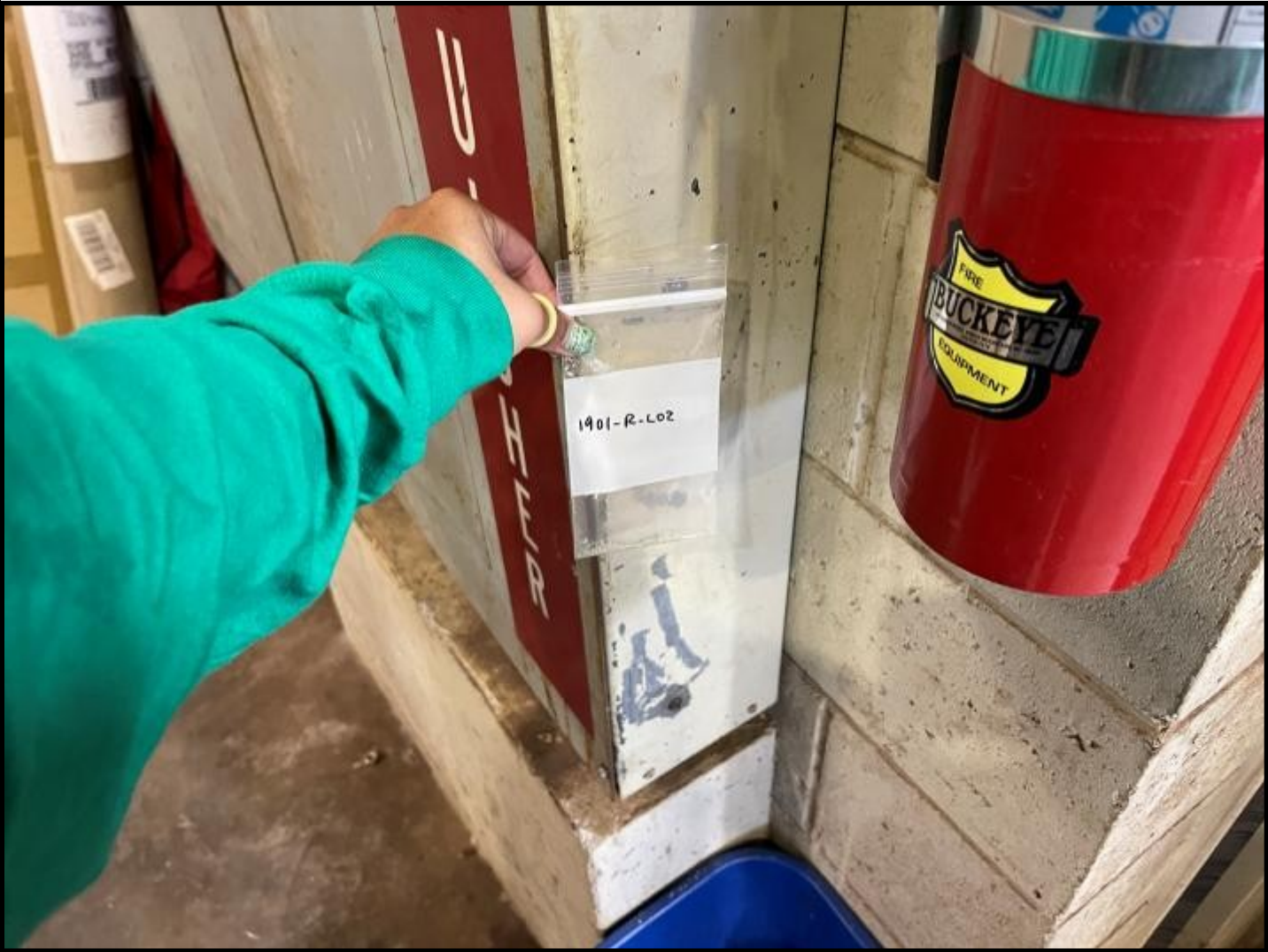
Photograph 5: Off-white paint on repair shop interior conduit Sample ID 1901-R-L02