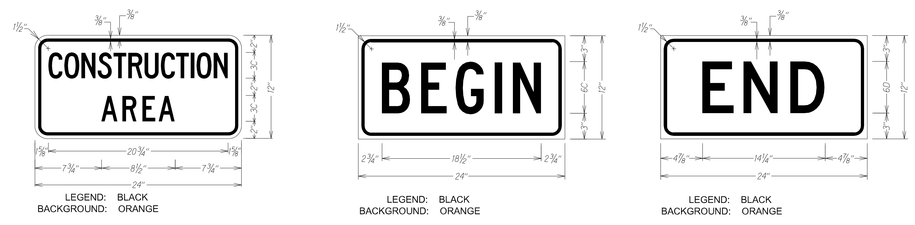
TYPICAL DETAIL FOR CONSTRUCTION SIGNS ON TWO LANE OR MULTILANE DIVIDED HIGH SPEED HIGHWAY