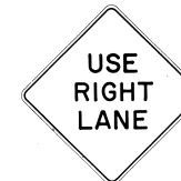
CW23-3(R) 48" x 48"