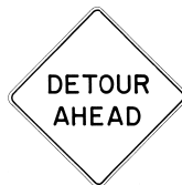
CW20-2d 48" x 48"