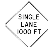
CW23-2b 48" x 48"