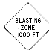
CW22-1b 48" x 48"