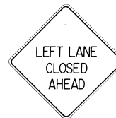
CW20-5d(L) 48" x 48"