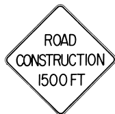
CW20-1a 48" x 48"