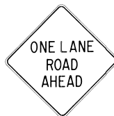
CW20-4d 48" x 48"