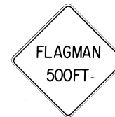
CW20-7c 48" x 48"