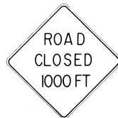
CW20-3b 48" x 48"