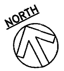
CABIN POWER & SIGNAL PLAN SCALE: 1/4"=1'-0"