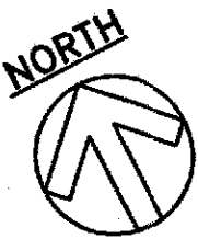
CABIN LIGHTING PLAN SCALE: 1/4"=1'-0"